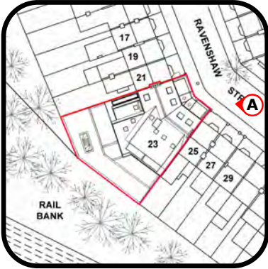
View A shows a 3D view of the proposed development from Ravenshaw Street, approximately at eye level.

DRAWINGS FOR PLANNING ONLY. Copyright C S Taylor 2016. No implied license exists. This drawing should not be used to calculate areas for the purpose of valuation. All dimensions to be checked on site by the contractor and such dimensions to be their responsibility. Do not scale drawings. This drawing is to be read in conjunction with all other contract documents and specifications and all other consultants drawings. All levels and dimensions should be checked on site. All work must comply with relevant British Standards and Building Regulation requirements. Drawing errors and omissions must be reported to the designer.