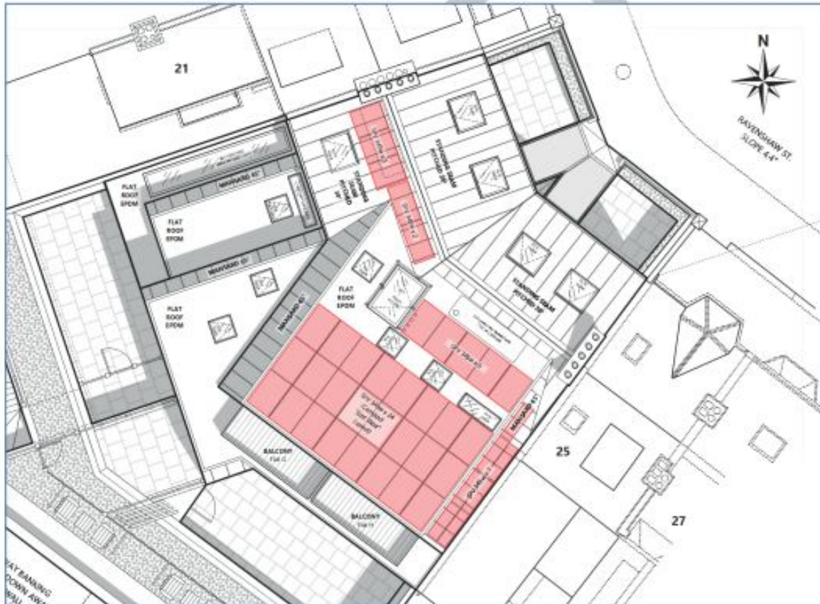
Figure 4: Roof area suitable for installation of Solar PV