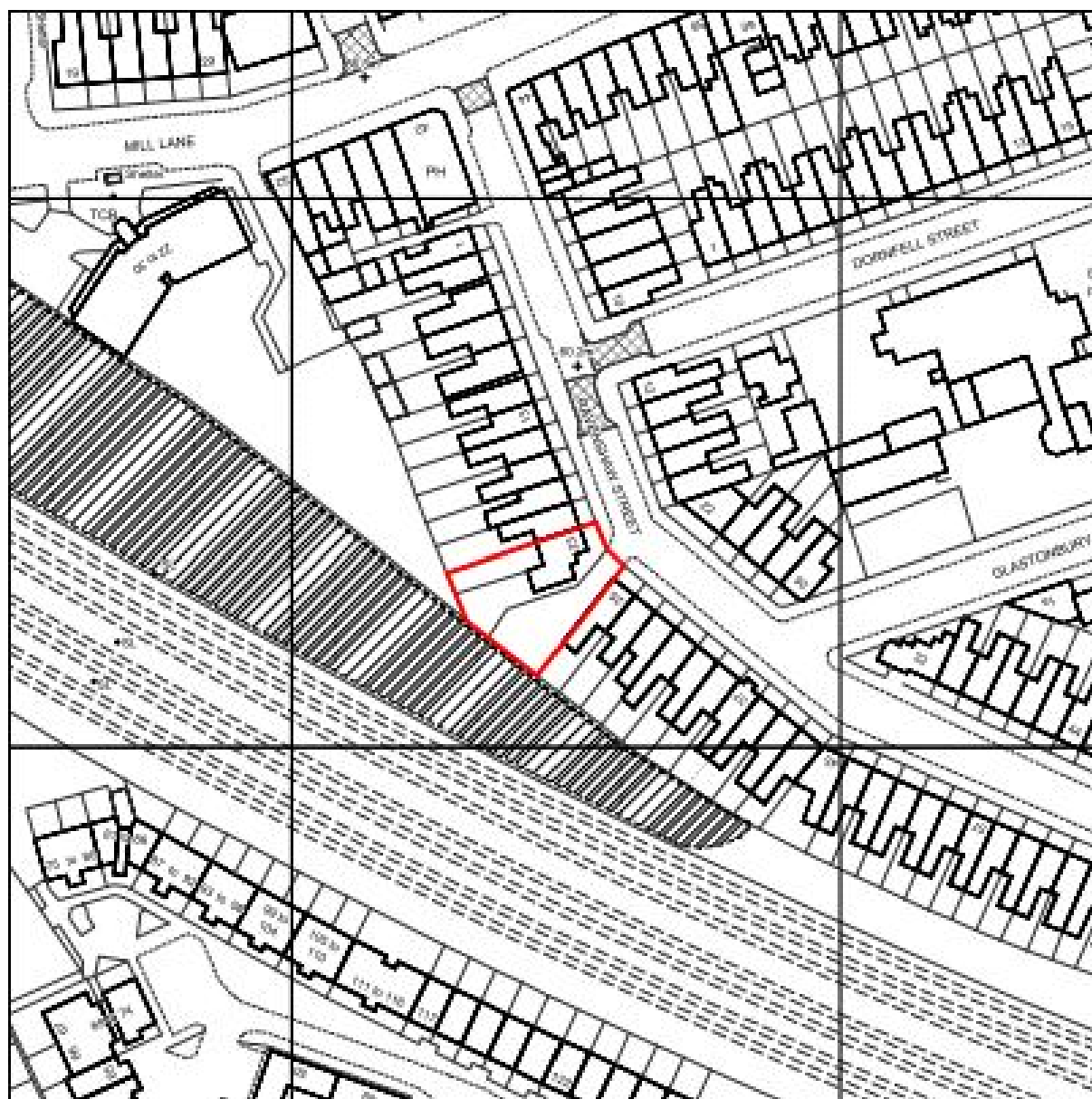
Figure 1: OS Map 1:1250