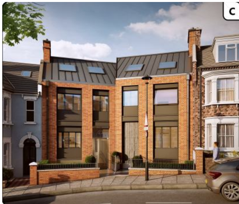
Figure 3: Front Elevations of the Proposed Development