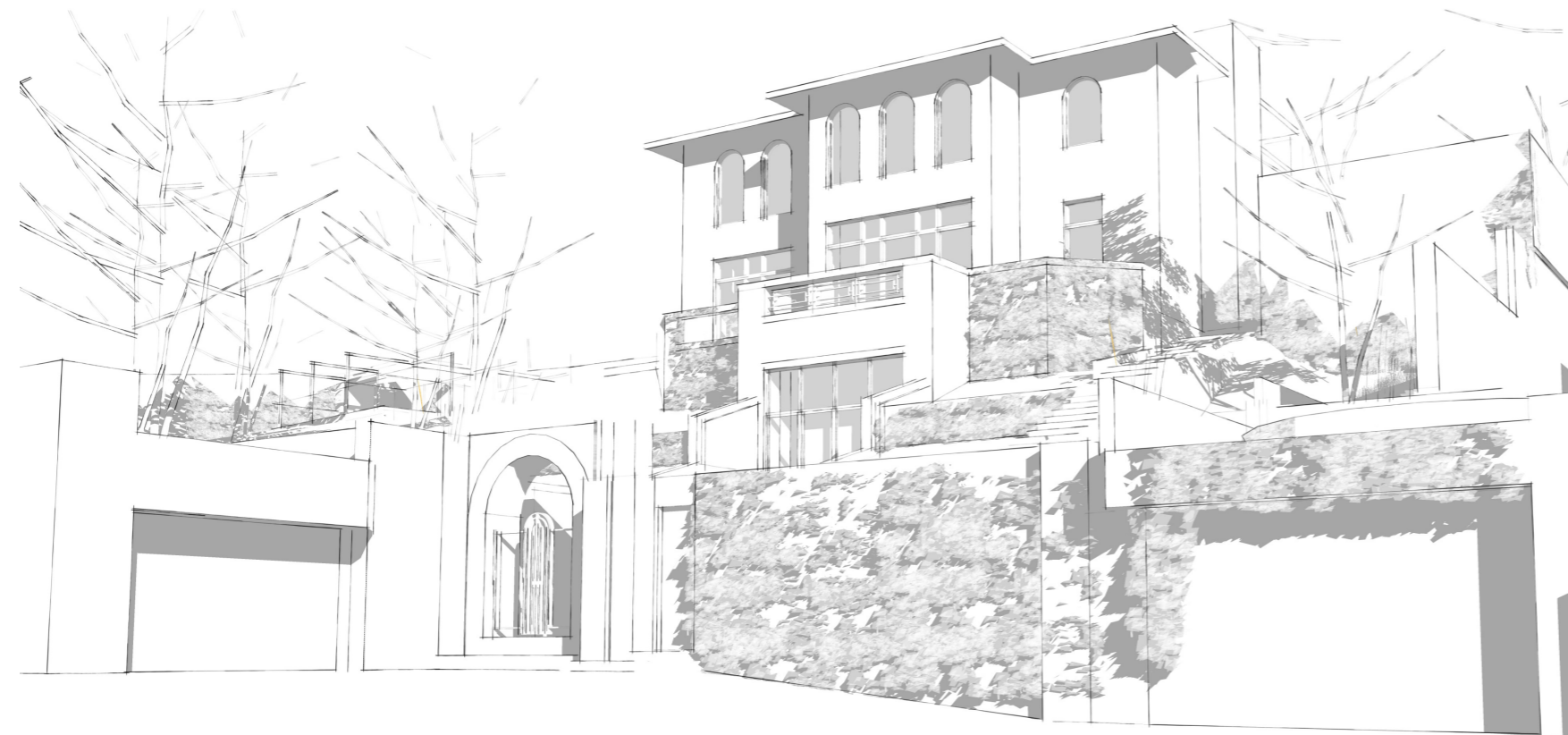
View of 4 Highfields Grove from Highfields Grove