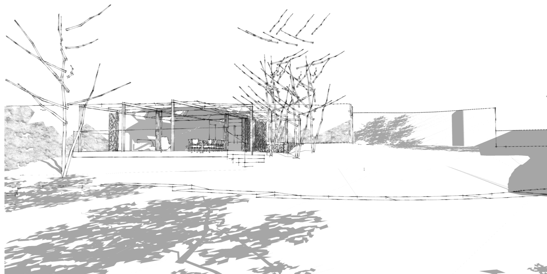
View of the proposed summer house from 4 Highfields Grove garden

TO BE READ IN CONJUNCTION WITH STRUCTURAL ENGINEER'S DRAWINGS. REPORT ALL DISCREPANCIES PRIOR TO PROCEEDING.