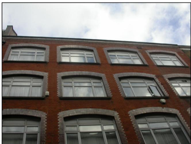
Images taken of front elevation to lower levels showing the main aluminium window openings to lower levels and new opening to replicate existing openings in width and finishing at new 4th floor front elevation