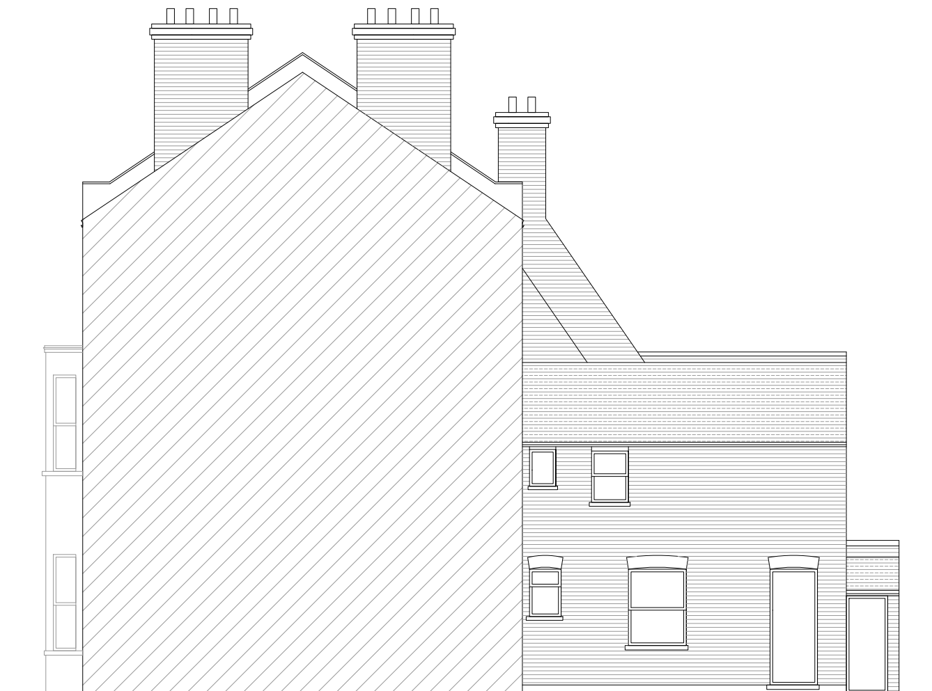
EXISTING SIDE ELEVATION (NORTH FACING)