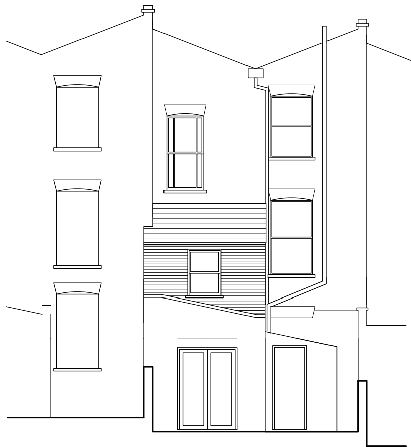
proposed rear elevation

Do not scale from this drawing. Dimensions are to be verified on site prior to construction. Notes