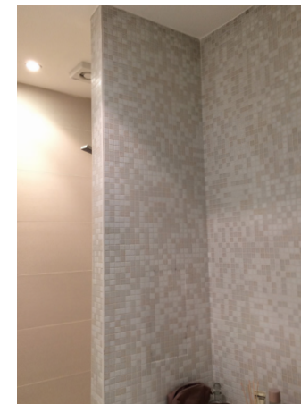
The wall from the WC/ shower side.