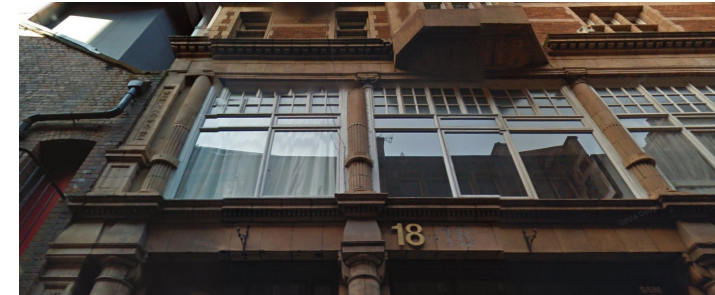
The exterior of flat 1d.

The units have undergone many previous alterations and little of the original interior survives. The proposed alteration is intended to be as sympathetic as possible to existing features and is limited to the interior of the building.