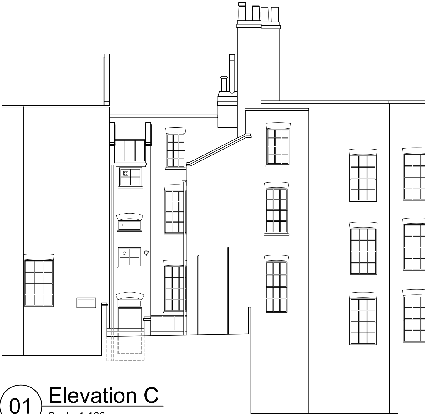
01 Elevation C Scale 1:100