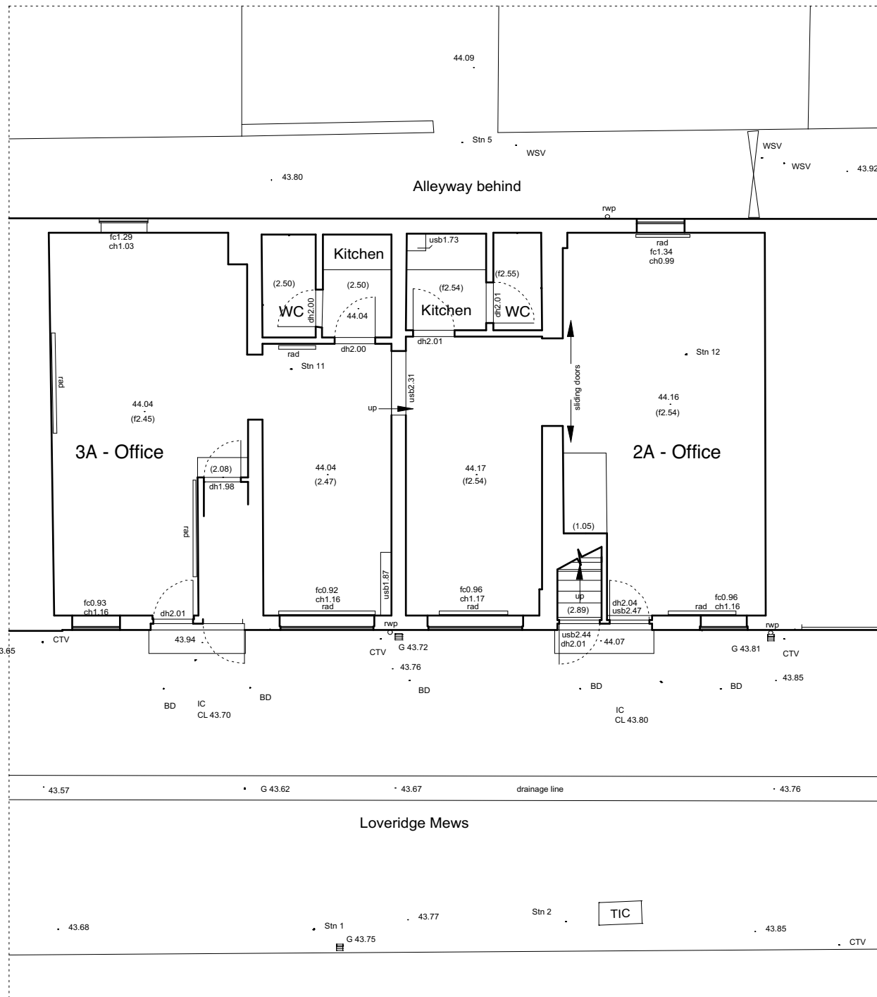
Existing GF Plan Scale 1:100