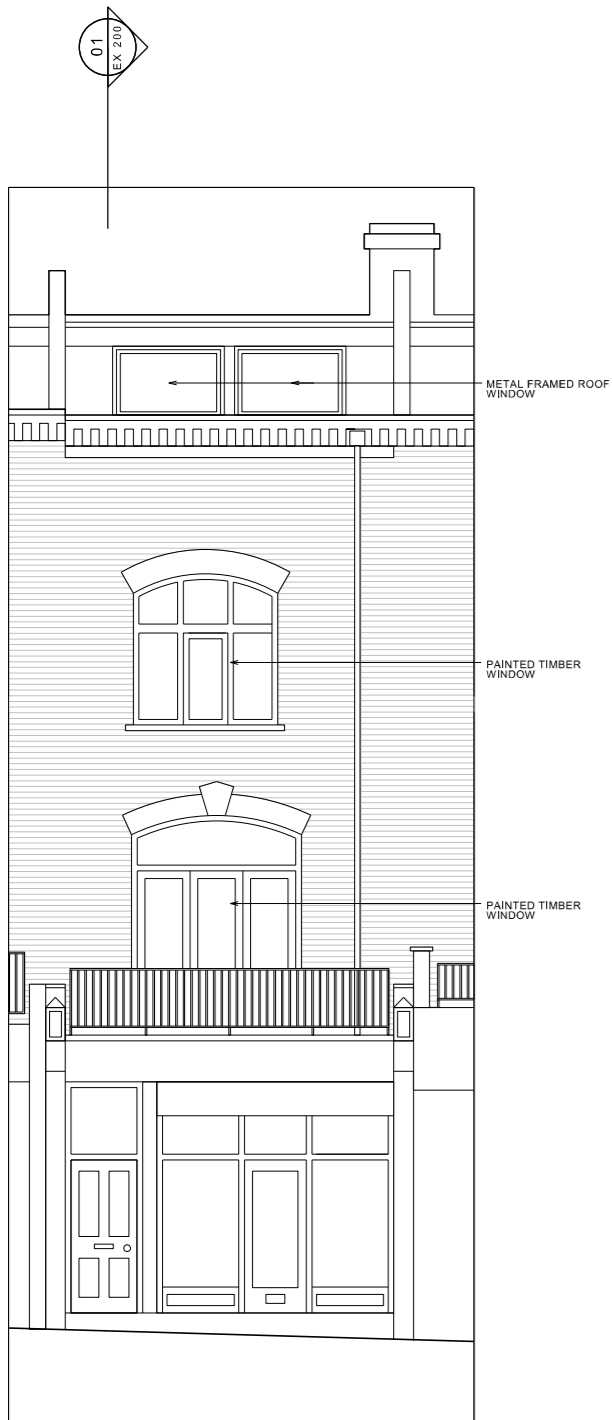
1/1623 EX 310 FRONT ELEVATION EXISTING