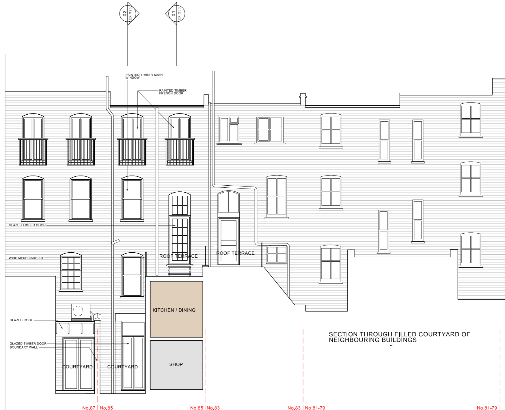
2/1623 EX 310 REAR SECTIONAL ELEVATION EXISTING

SECTION THROUGH FILLED COURTYARD OF NEIGHBOURING BUILDINGS