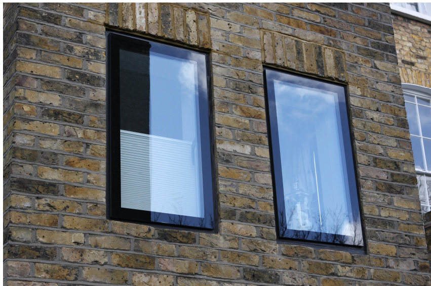
Example of flush glazed windows

The Camden Square Conservation Area Appraisal and Management Strategy states that a successful modern design can (6) enhance the conservation area, by carefully assessing and responding to the forms and qualities of surrounding buildings and spaces.+