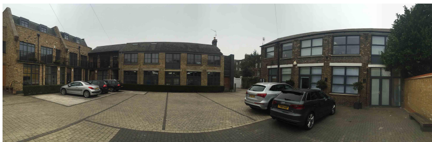
44 St Paul's Crescent development

The site is completely screened from the public realm by neighbouring houses on Agar Grove and St Paul's Crescent.