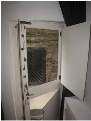
glazed door to front area