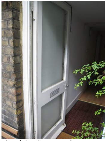
glazed door to rear garden