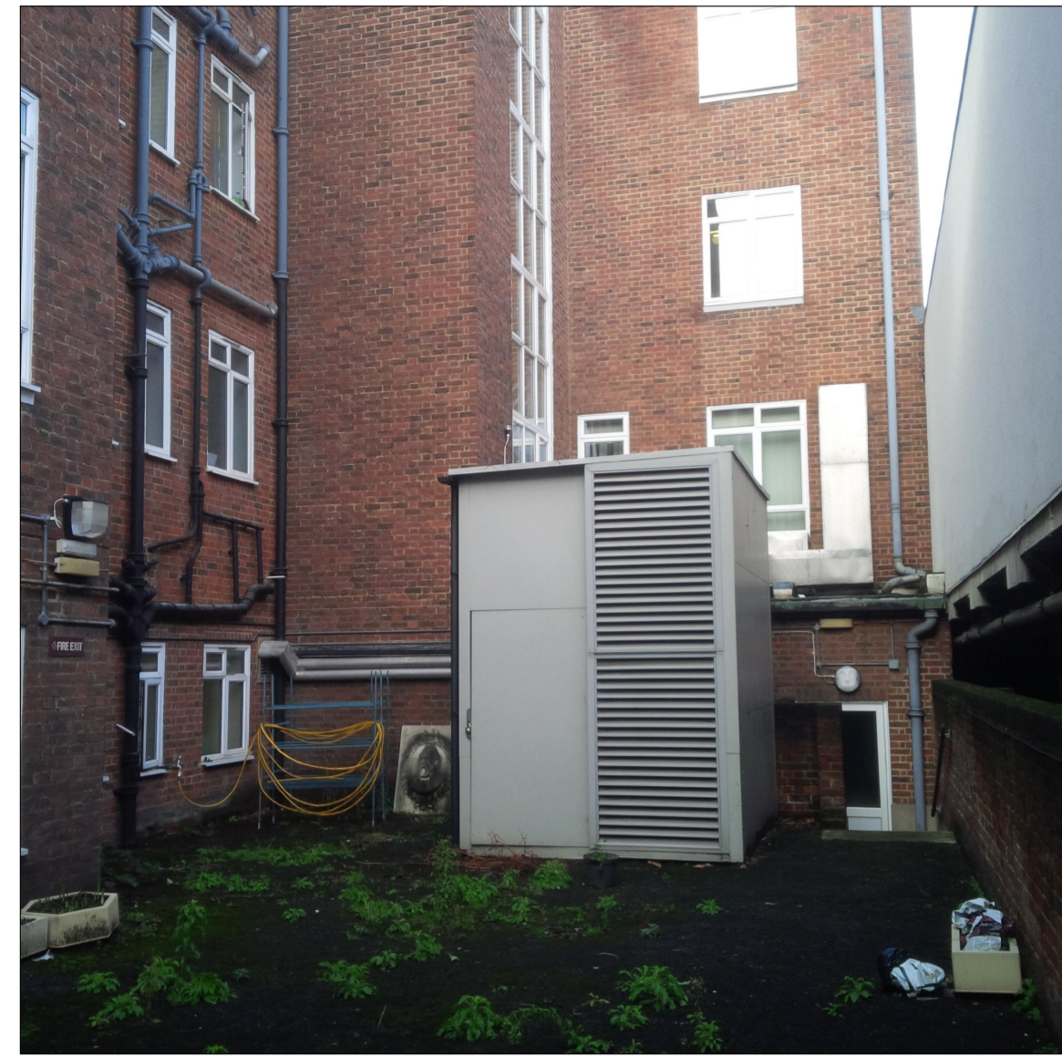
2 EXISTING PHOTOGRAPH PROPOSED PLANT SCREEN AREA