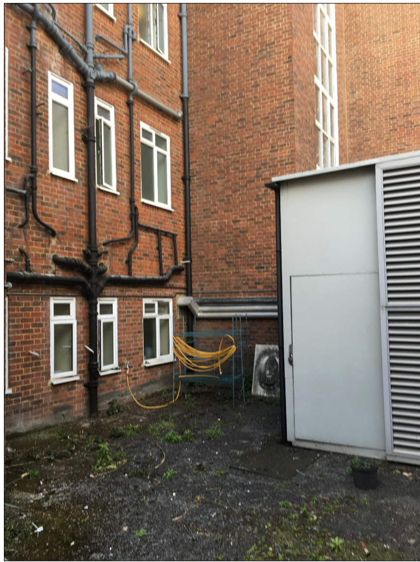
1 EXISTING PHOTOGRAPH PROPOSED LIFT AREA