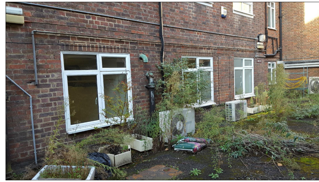
3 EXISTING PHOTOGRAPH PROPOSED PLANT SCREEN AREA