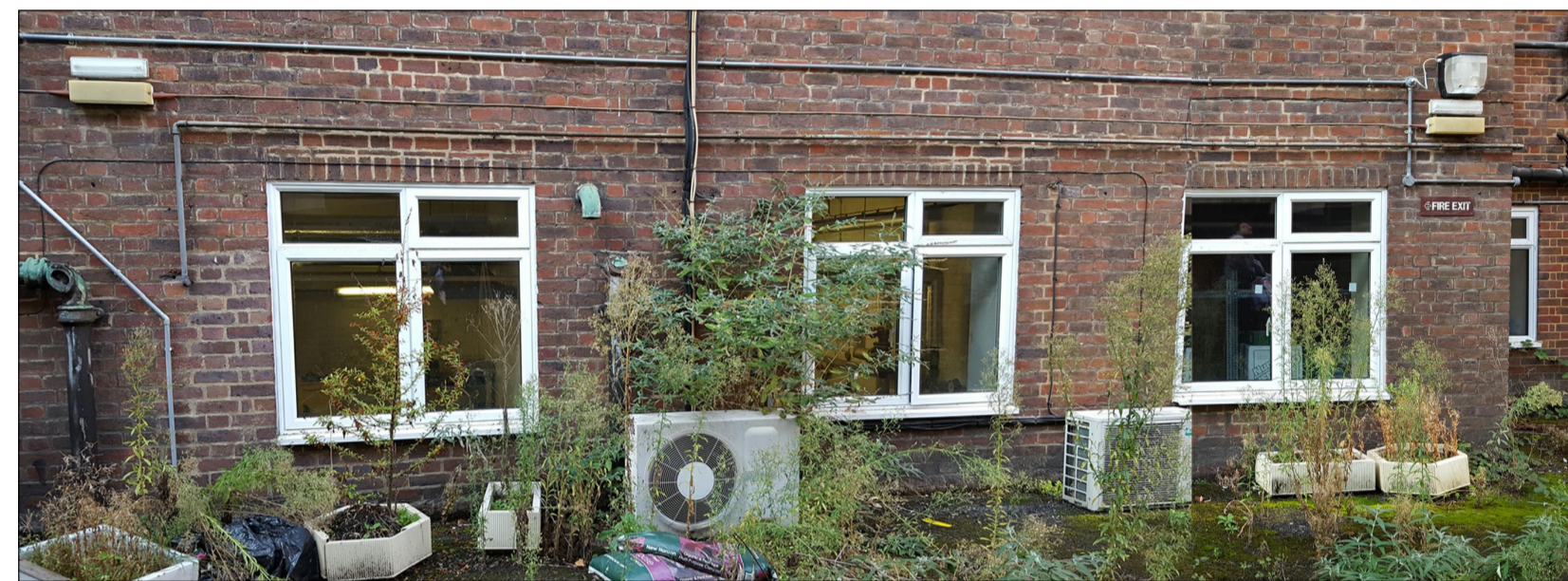
4 EXISTING PHOTOGRAPH PROPOSED PLANT SCREEN AREA