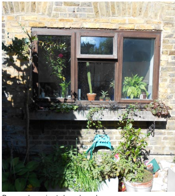
Proposed opening to be enlarged