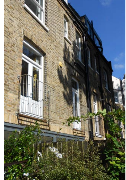
Number 6 Bisham Gardens