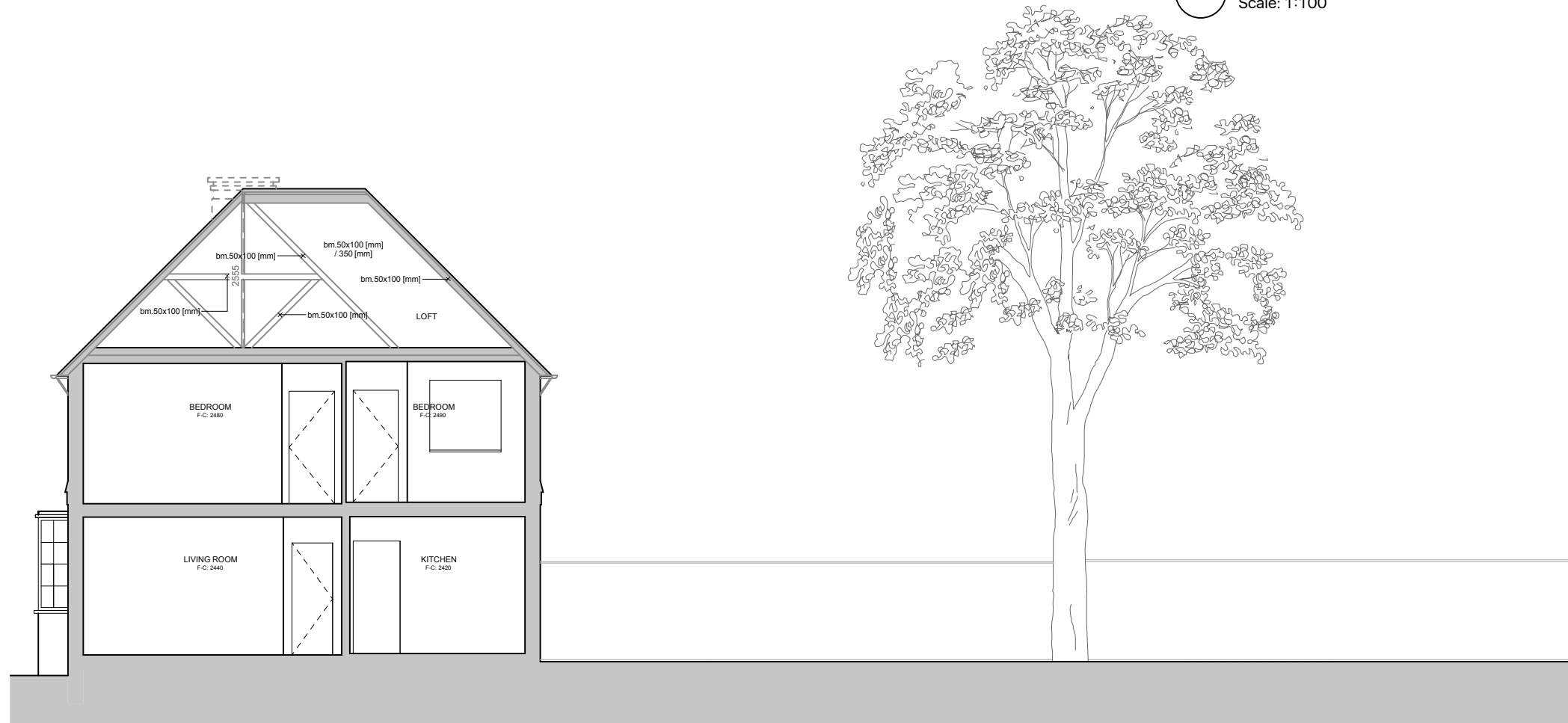
2 GA_Proposed Section AA Scale: 1:100