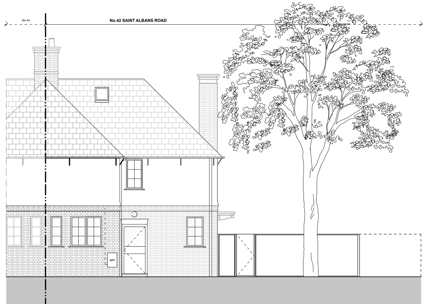
2 GA Proposed Rear Elevation Scale: 1:100