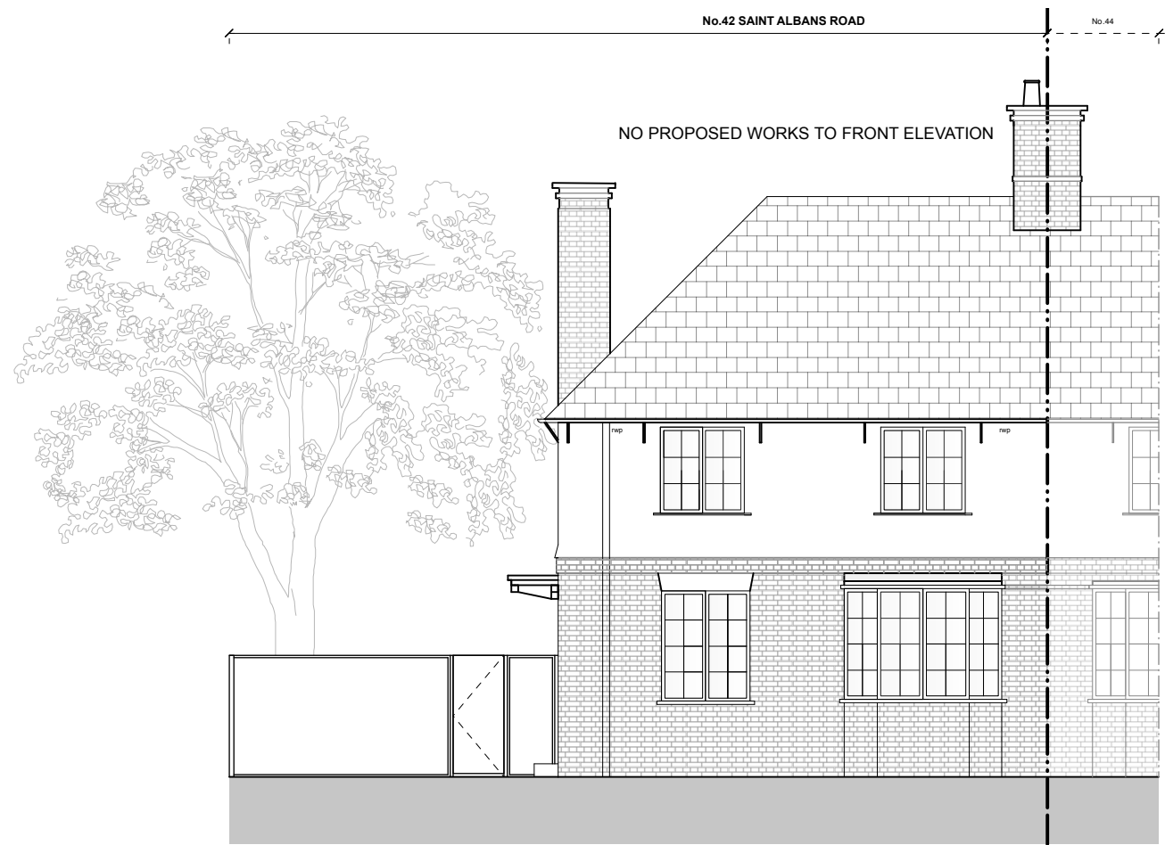
1 GA Proposed Front Elevation Scale: 1:100