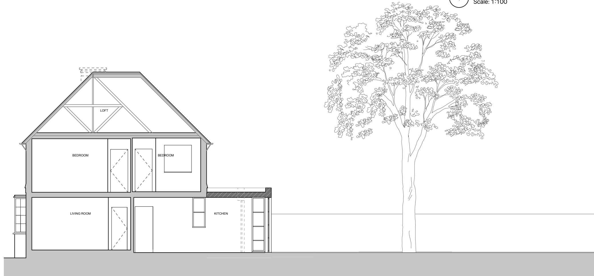
2 GA_Proposed Section AA Scale: 1:100