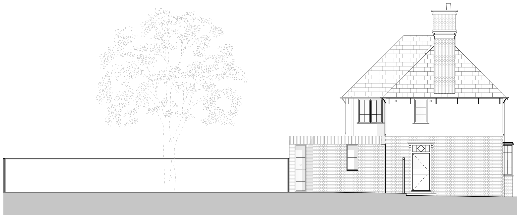
1 GA_Proposed Side Elevation Scale: 1:100