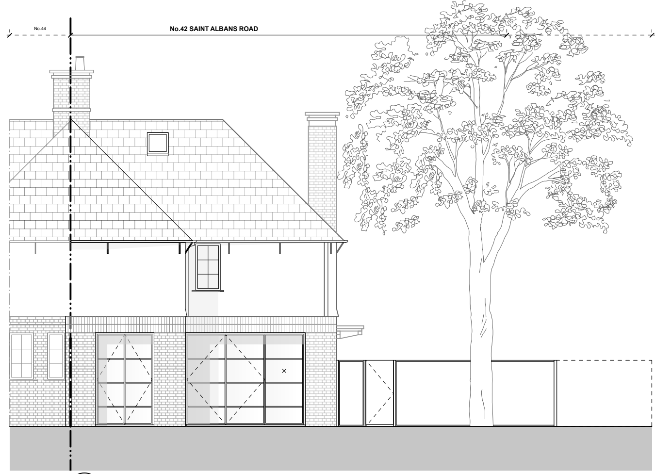
2 GA Proposed Rear Elevation Scale: 1:100