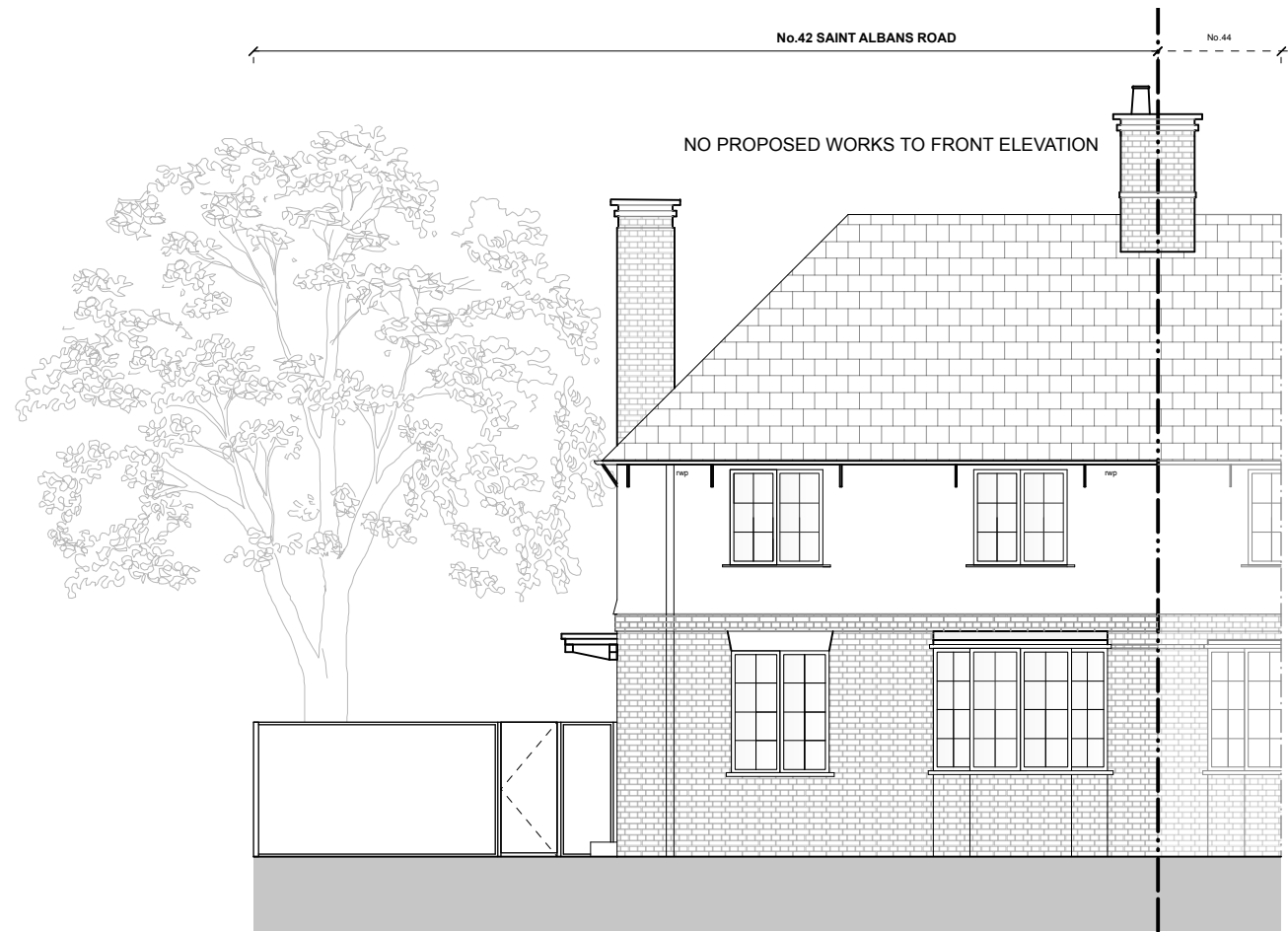
1 GA Proposed Front Elevation Scale: 1:100