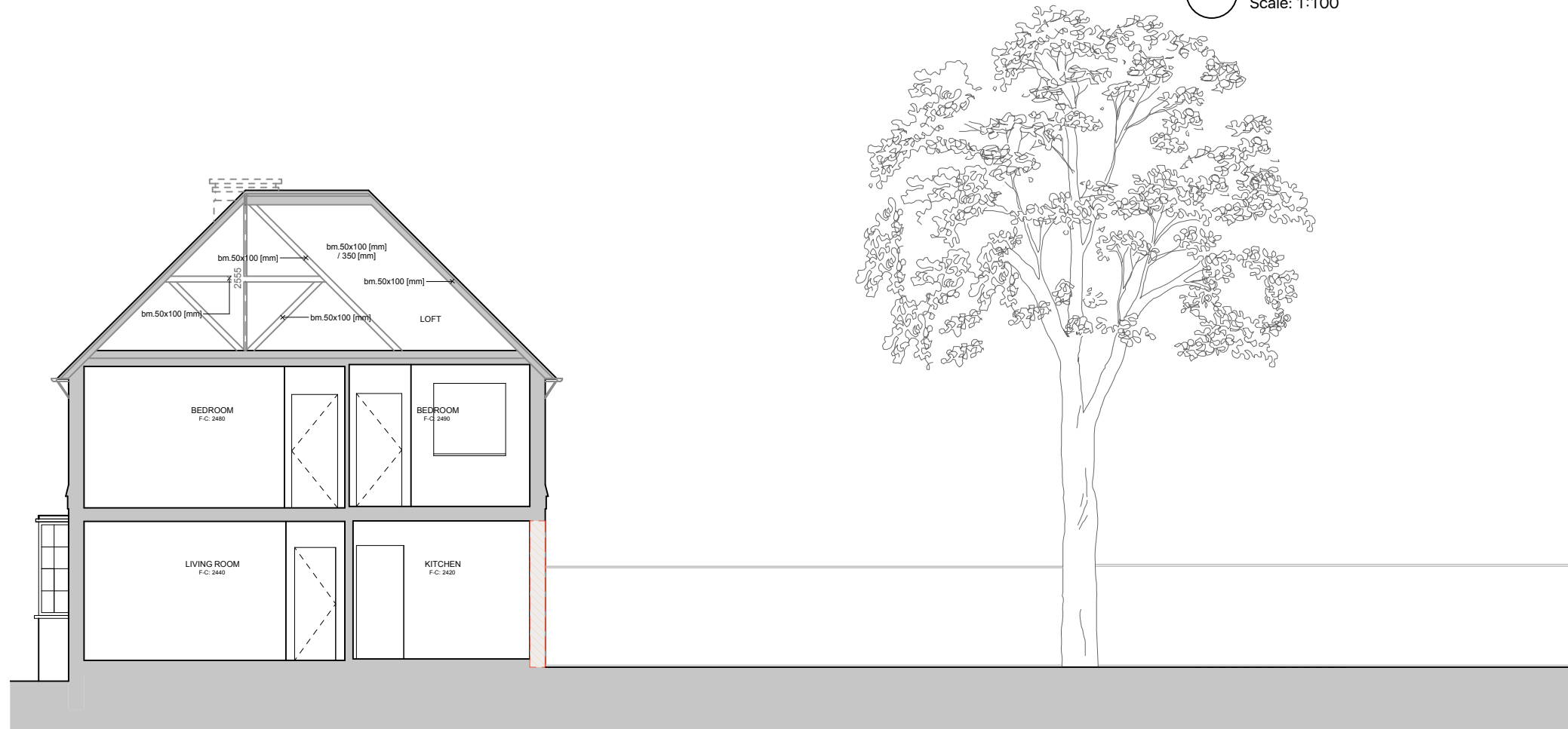
2 GA_Proposed Section AA Scale: 1:100