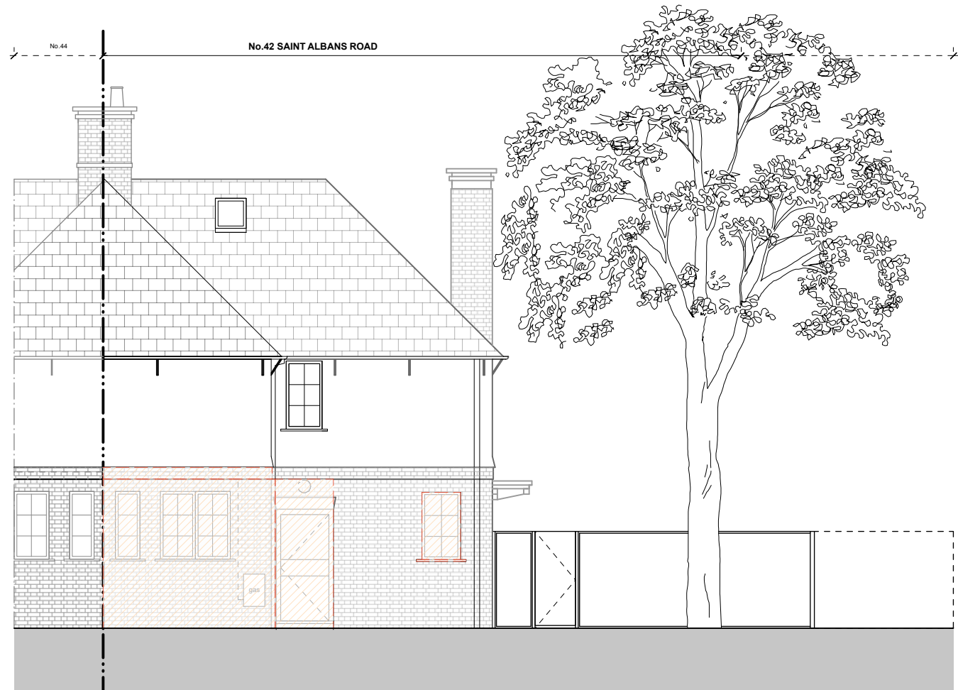
2 GA_Proposed Rear Elevation Scale: 1:100