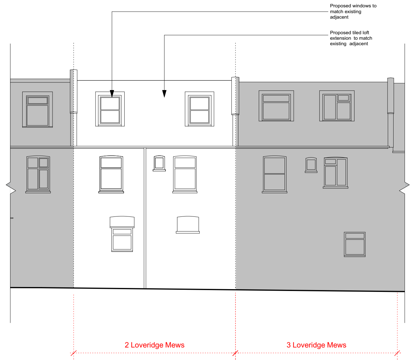
Proposed Rear Elevation Scale 1:100