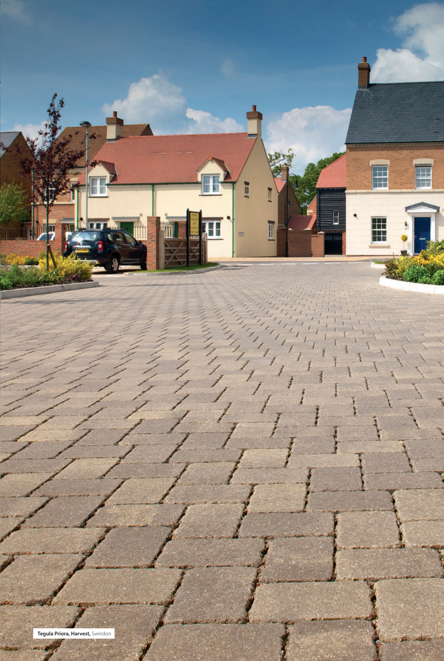
Tegula Priora, Harvest, Swindon