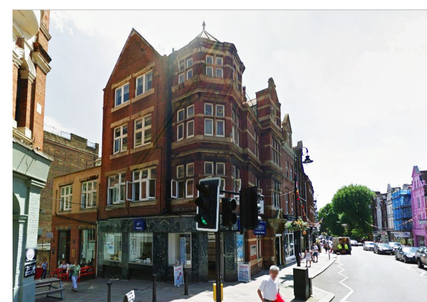
④ Existing site photograph - Heath Street NTS