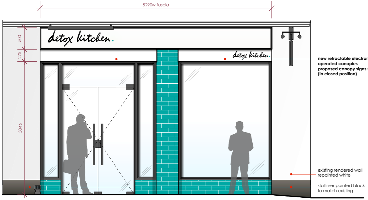
proposed SHOPFRONT ELEVATION AA WITH CANOPY CLOSED