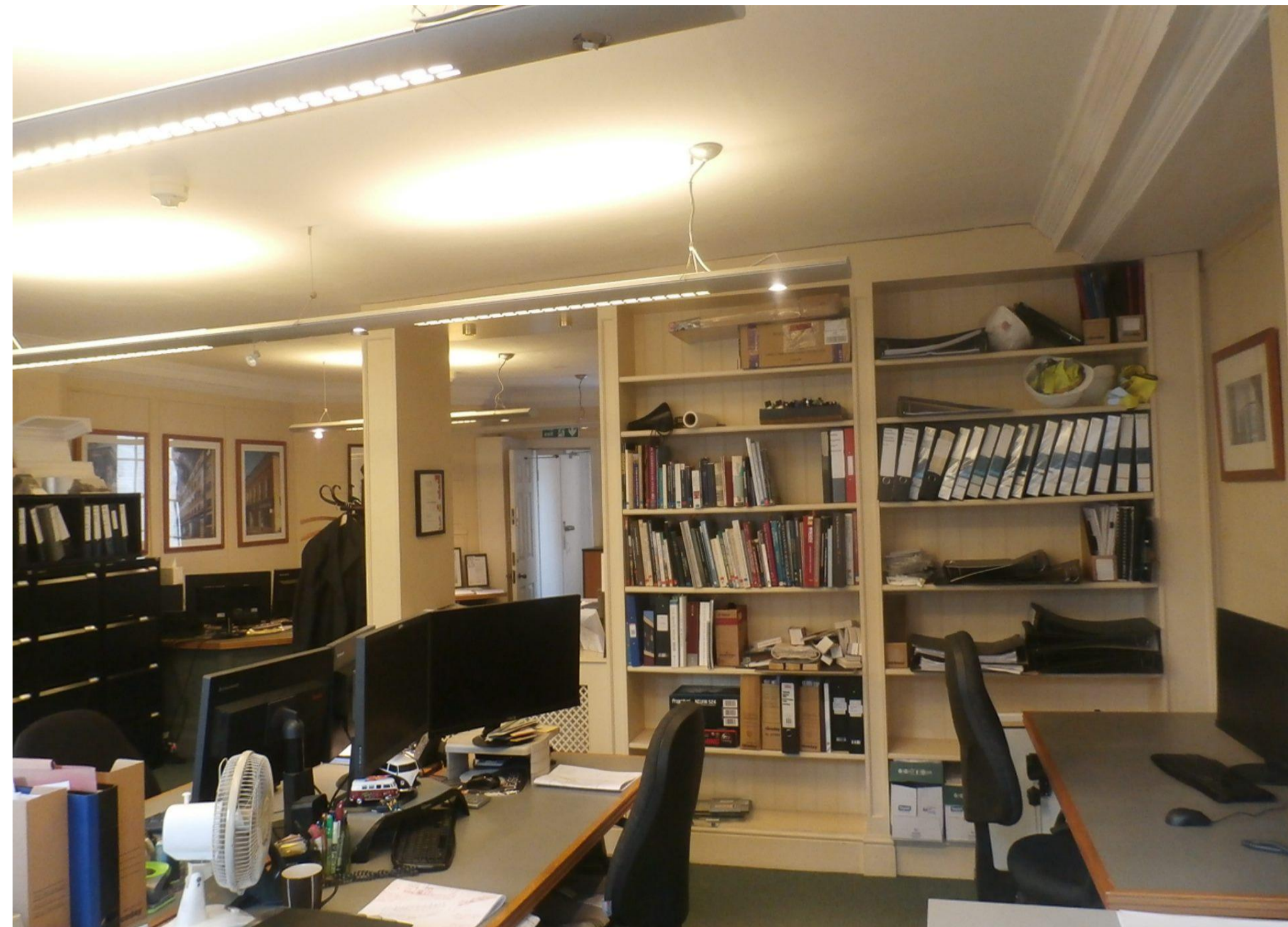
Existing Studio Shelving