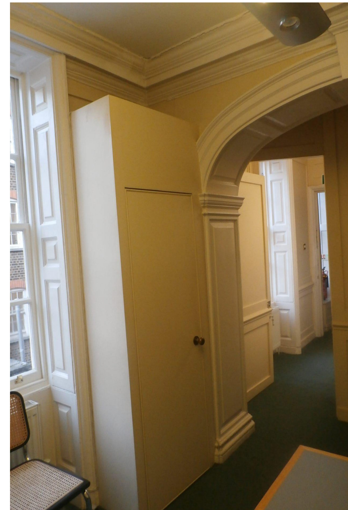
Existing Boiler Cupboard