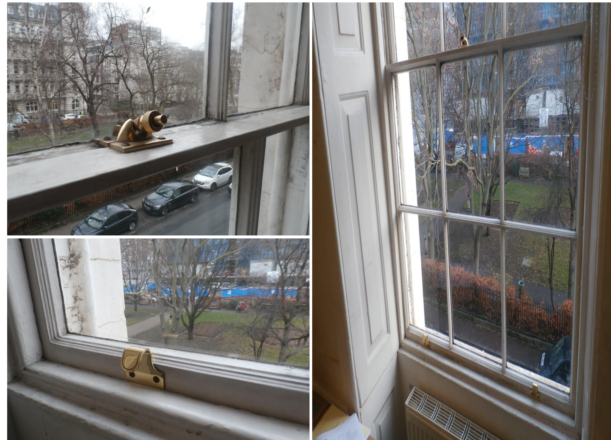
Existing Window Ironmongery

Adjacent Properties and Boundaries are shown for illustrative purposes only and have not been surveyed unless otherwise stated. All areas shown are approximate and should be verified before forming the basis of a decision. Do not scale other than for Planning Application purposes. All dimensions must be checked by the contractor before commencing work on site. No deviation from this drawing will be permitted without the prior written consent of the Architect. The copyright of this drawing remains with the Architect and may not be reproduced in any form without prior written consent. Ground Floor Slabs, Foundations, Sub-Structures, etc. All work below ground level is shown provisionally. Inspection of ground condition is essential prior to work commencing. Reassessment is essential when the ground conditions are apparent, and redesign may be necessary in the light of soil conditions found. The responsibility for establishing the soil and sub-soil conditions rests with the contractor.