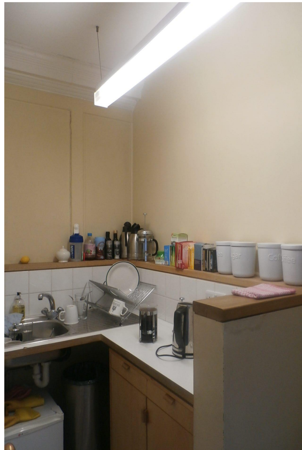
Existing Kitchen Enclosure