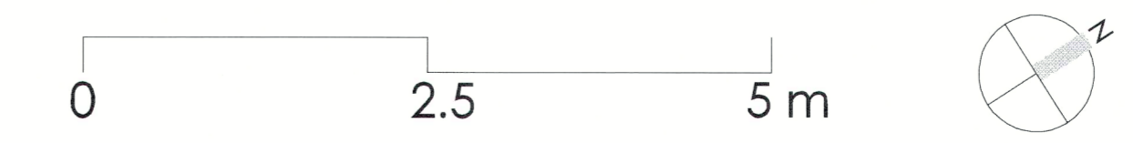
Second Floor Plan 1:50