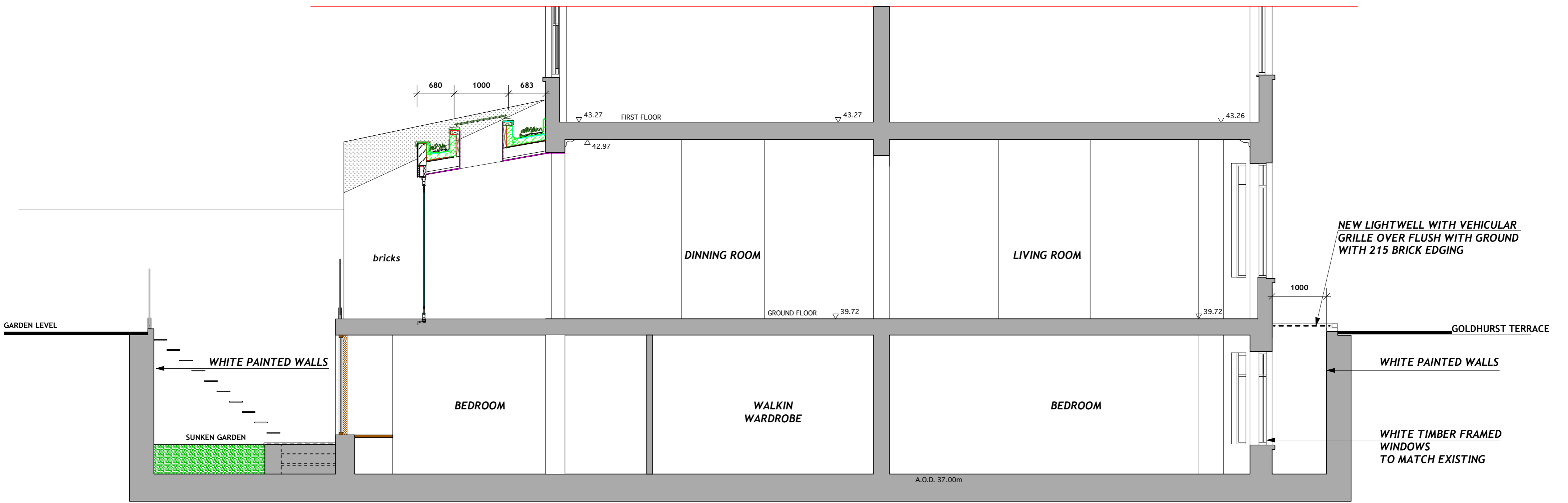
SECTIONS B B