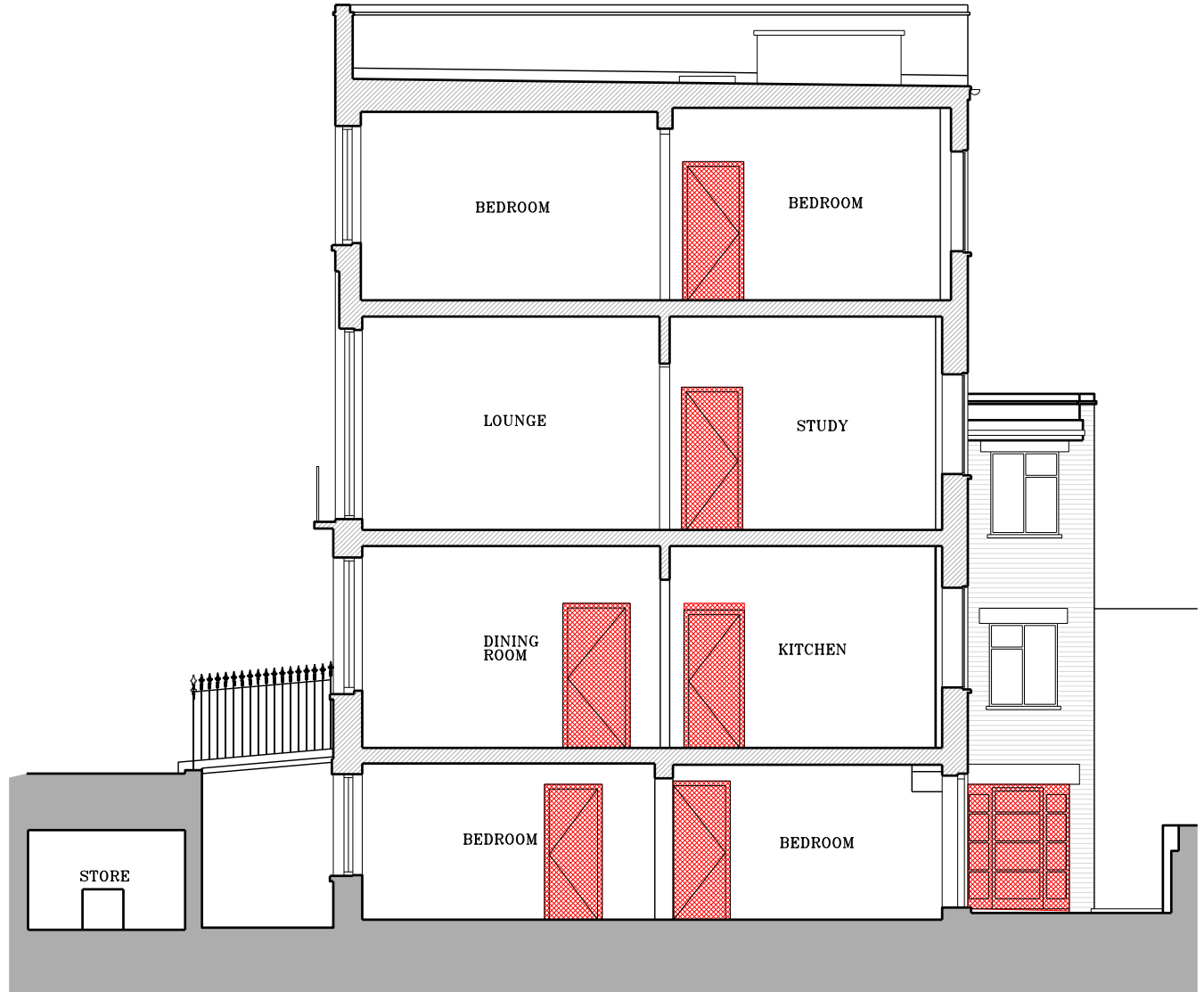
02 EXISTING SECTION AA