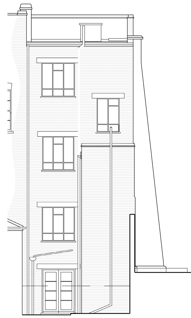
02 EXISTING REAR ELEVATION