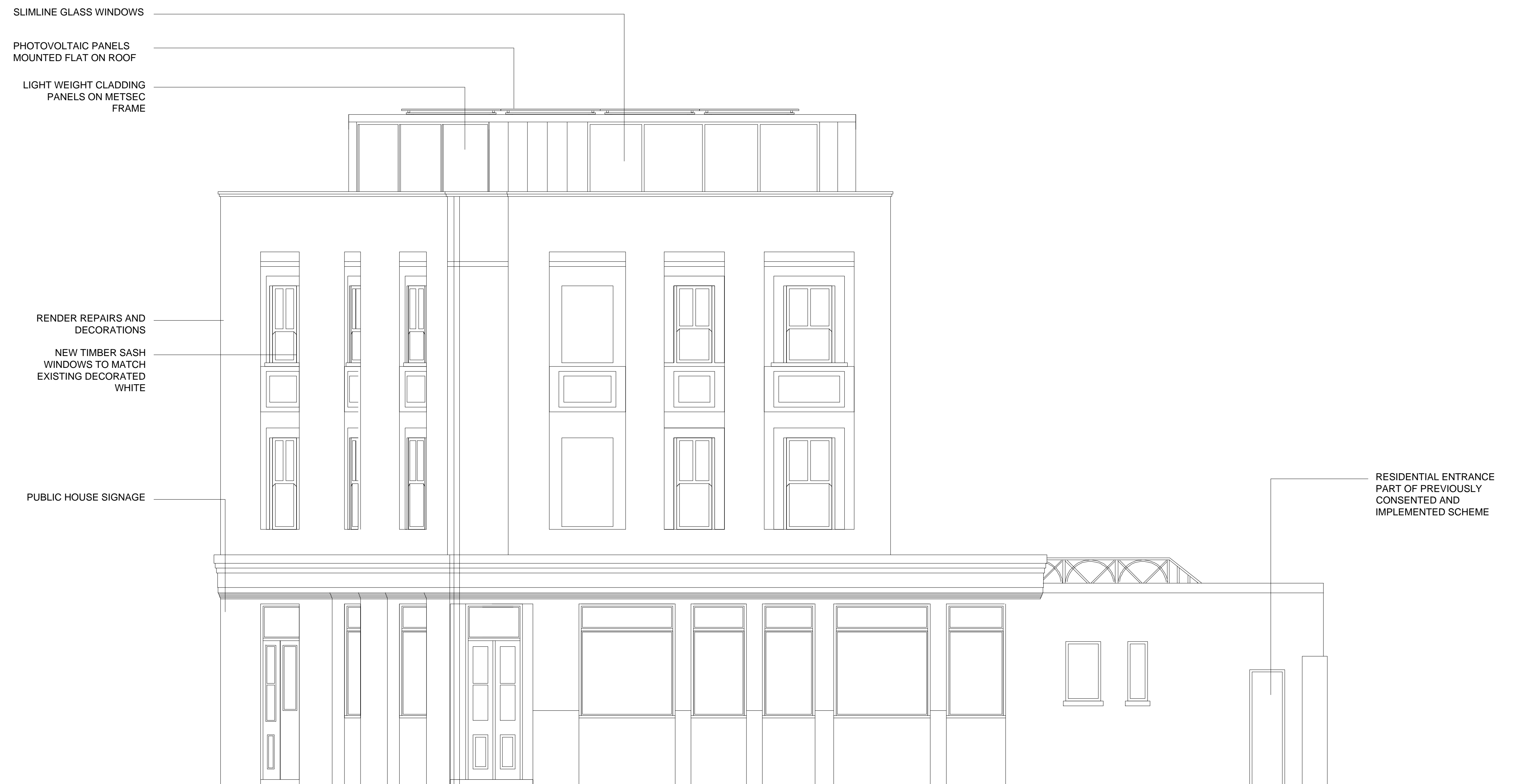
PROPOSED CASTLE ROAD ELEVATION