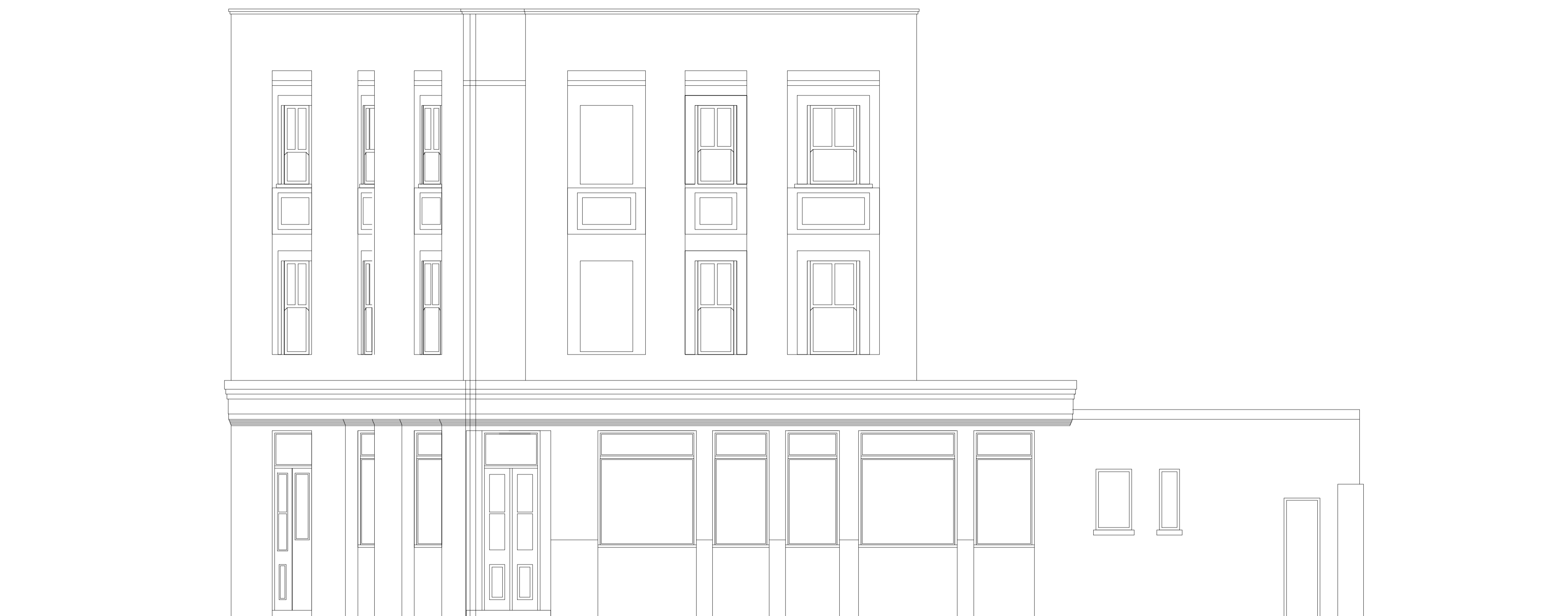
EXISTING CASTLE ROAD ELEVATION