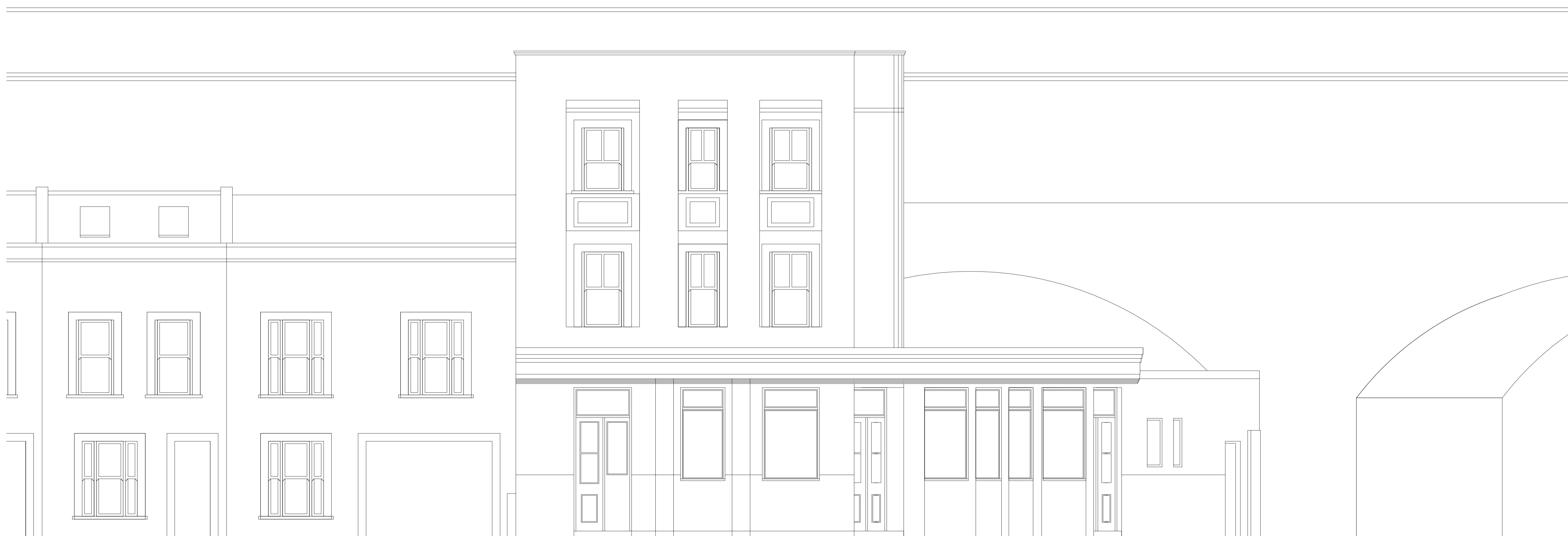
EXISTING HADLEY STREET ELEVATION