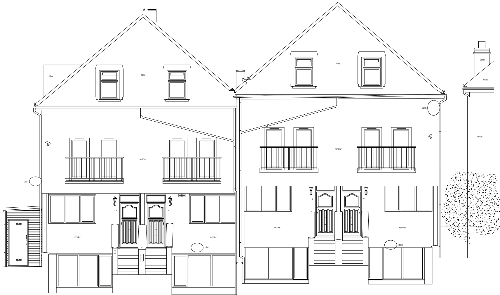
Existing front / south elevation

Dimensioning - 1. IMPORTANT - All dimensions taken from finished face unless otherwise stated, if in doubt confirm before proceeding. 2. Dimensions followed by [ ref ] indicates reference dim, these should be used as check dims only and not as the primary source for setting out. 3. Dimensions followed by [ s/o ] indicates dim of structural opening. 4. Dimensions followed by [ site ] indicates dims subject to site conditions.