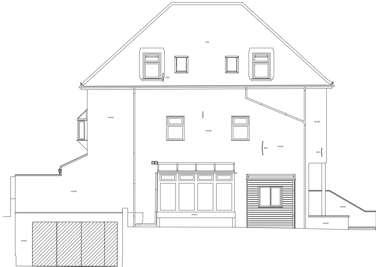
Existing side / west elevation