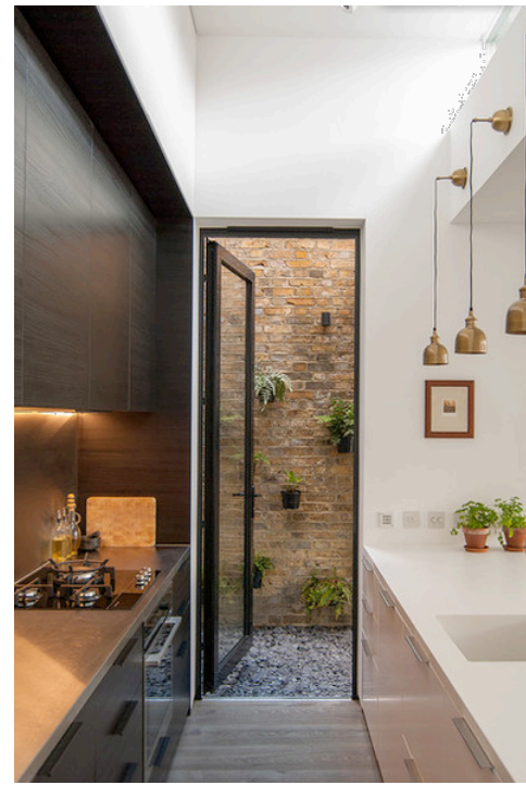
Lightwell precedent 2