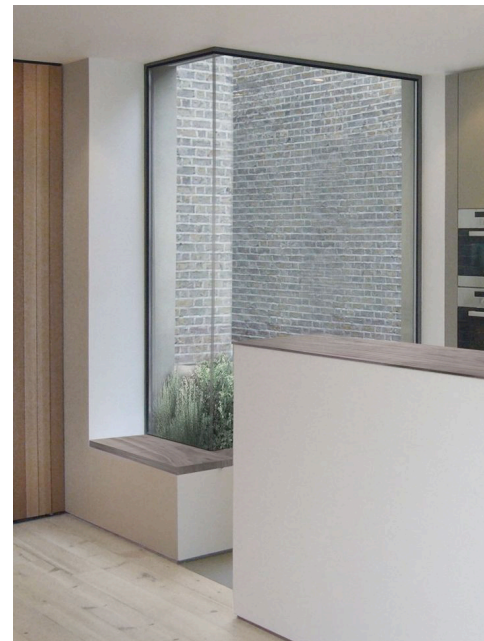
Lightwell precedent 4