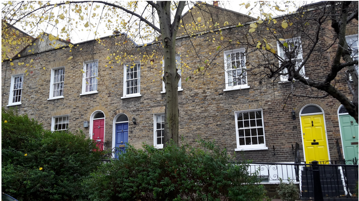
Front elevation – house with blue door