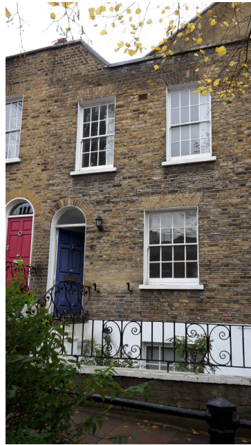
View from street – house with blue door