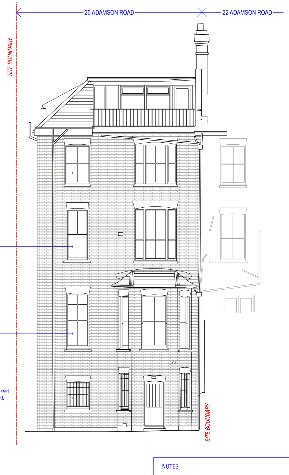
[01] EXISTING WEST ELEVATION