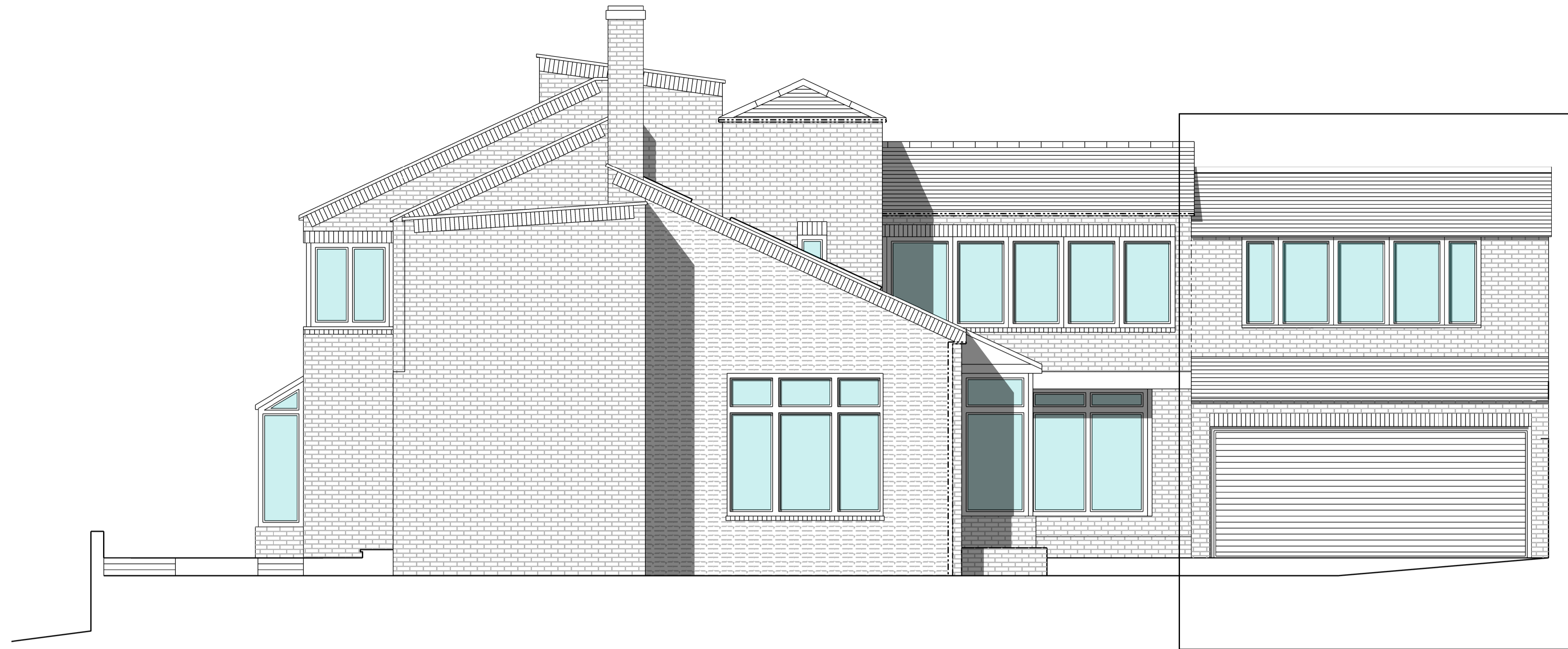
01 SIDE (WEST) ELEVATION AS PROPOSED KAM02_P_132 SCALE: 1:50 @ A1