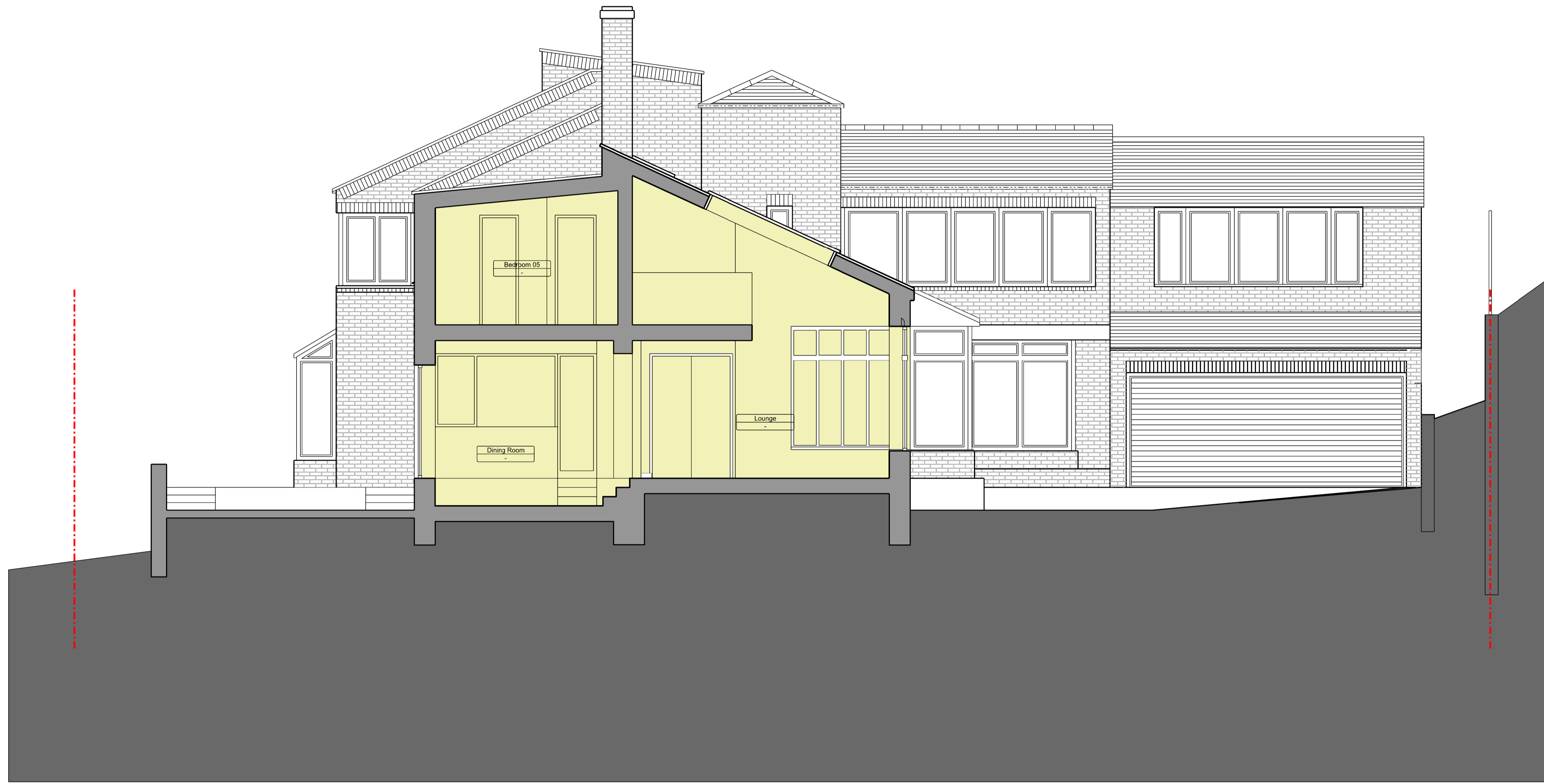
01 SECTION CC - AS PROPOSED KAM02_P_123 SCALE 1:50@A1/1:100@A3

General Notes: Should any discrepancies be noted, please inform the Architect