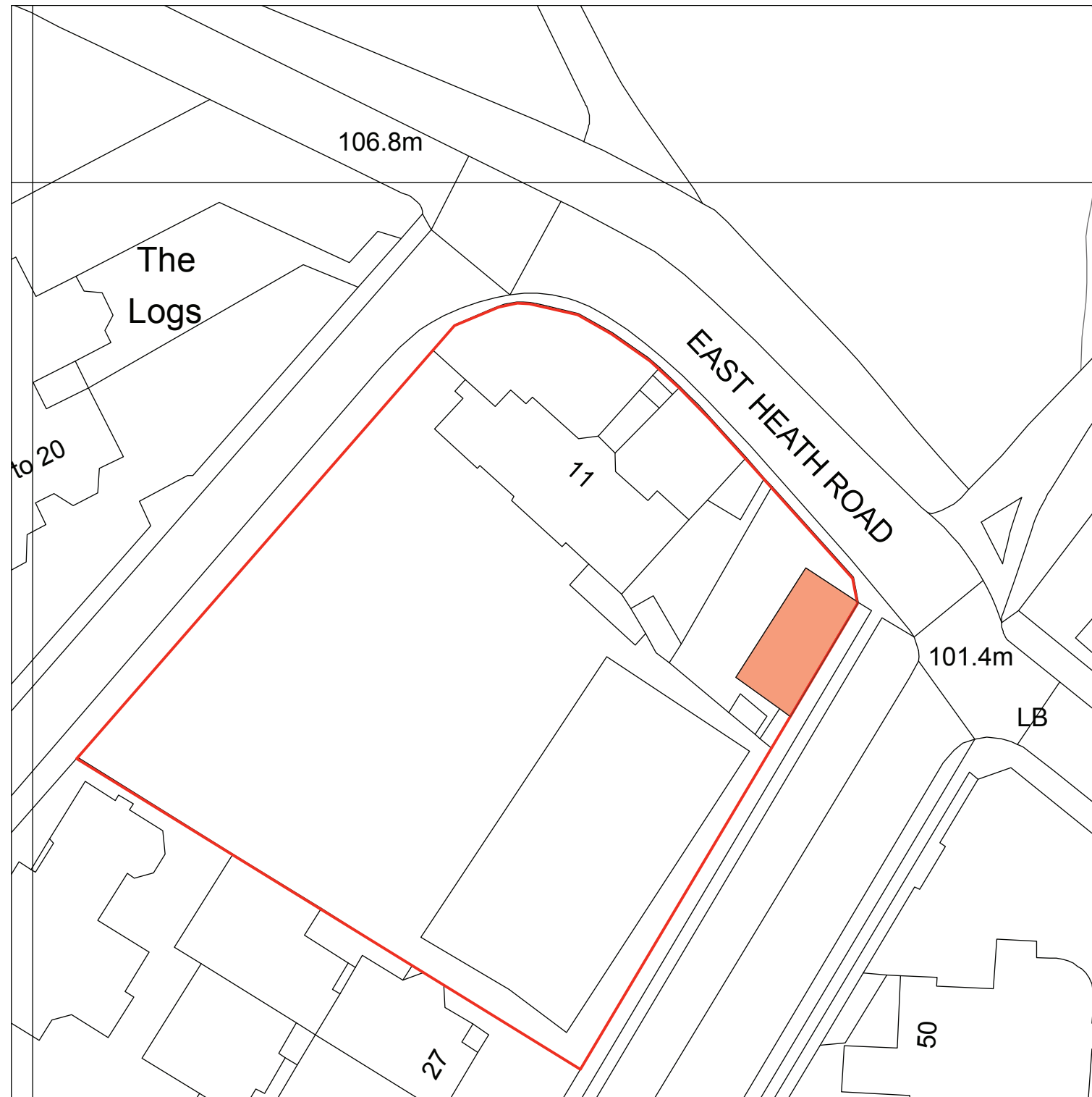
1:500 BLOCK PLAN