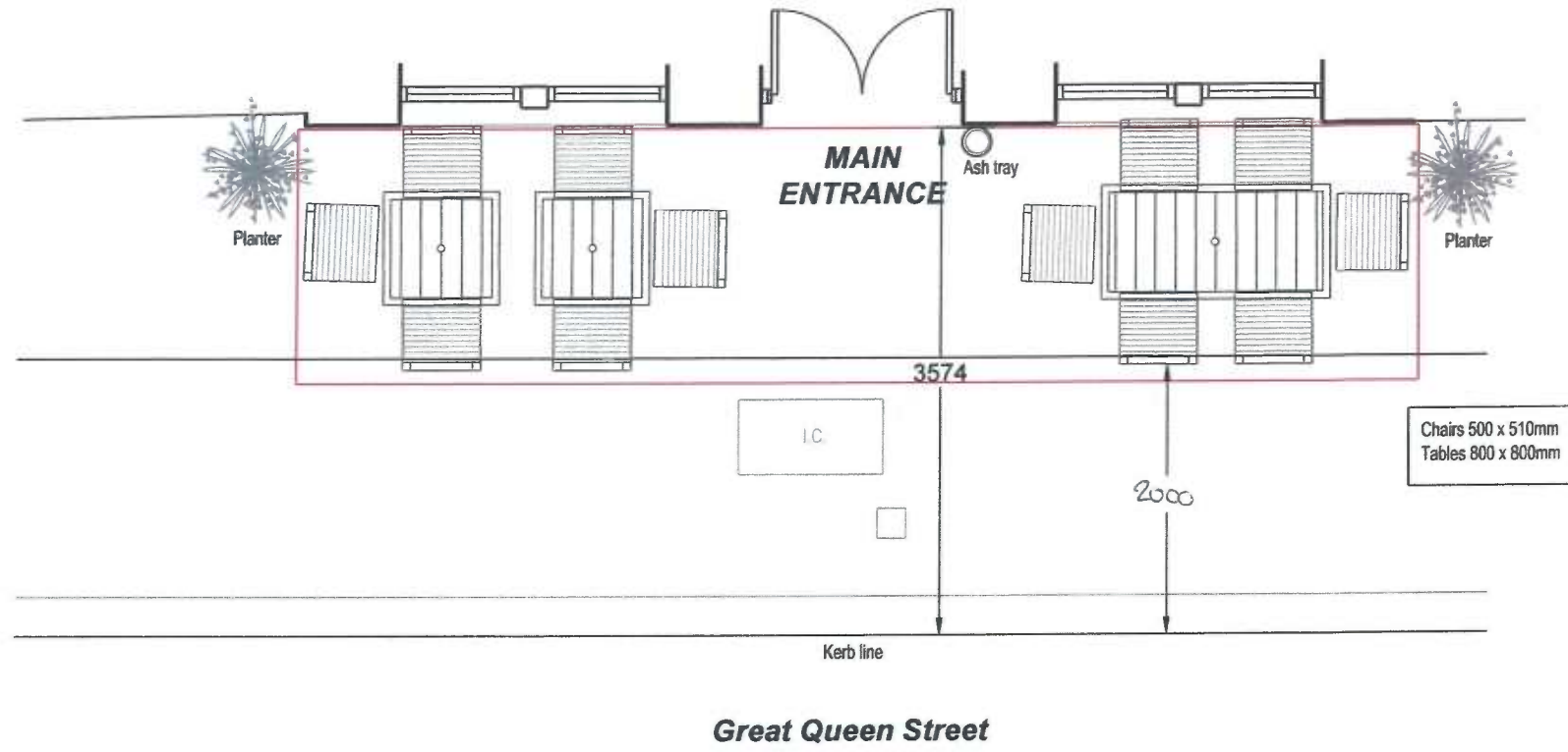
PAVEMENT LAYOUT PLAN