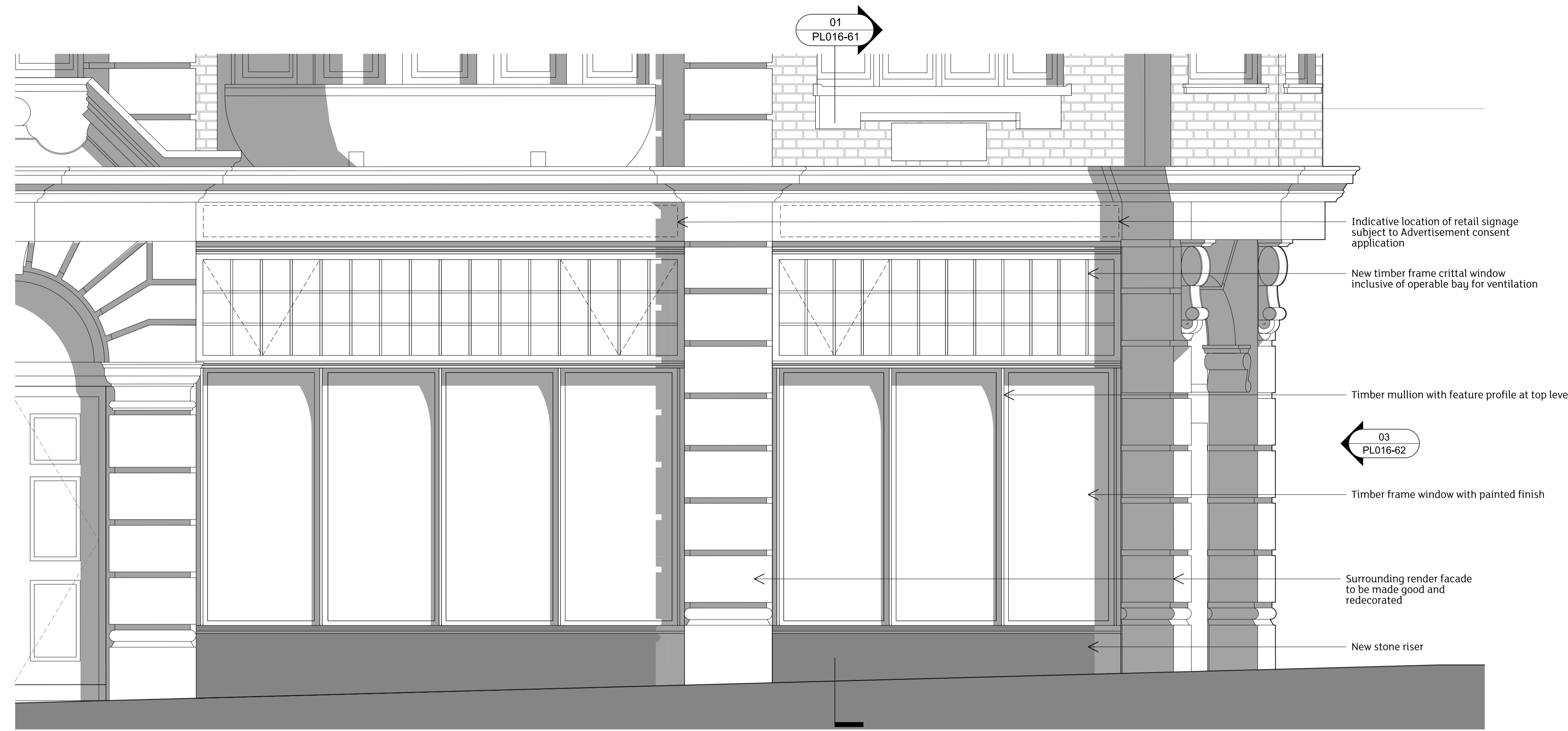
01 28 Denmark Street Proposed South Elevation 1:25