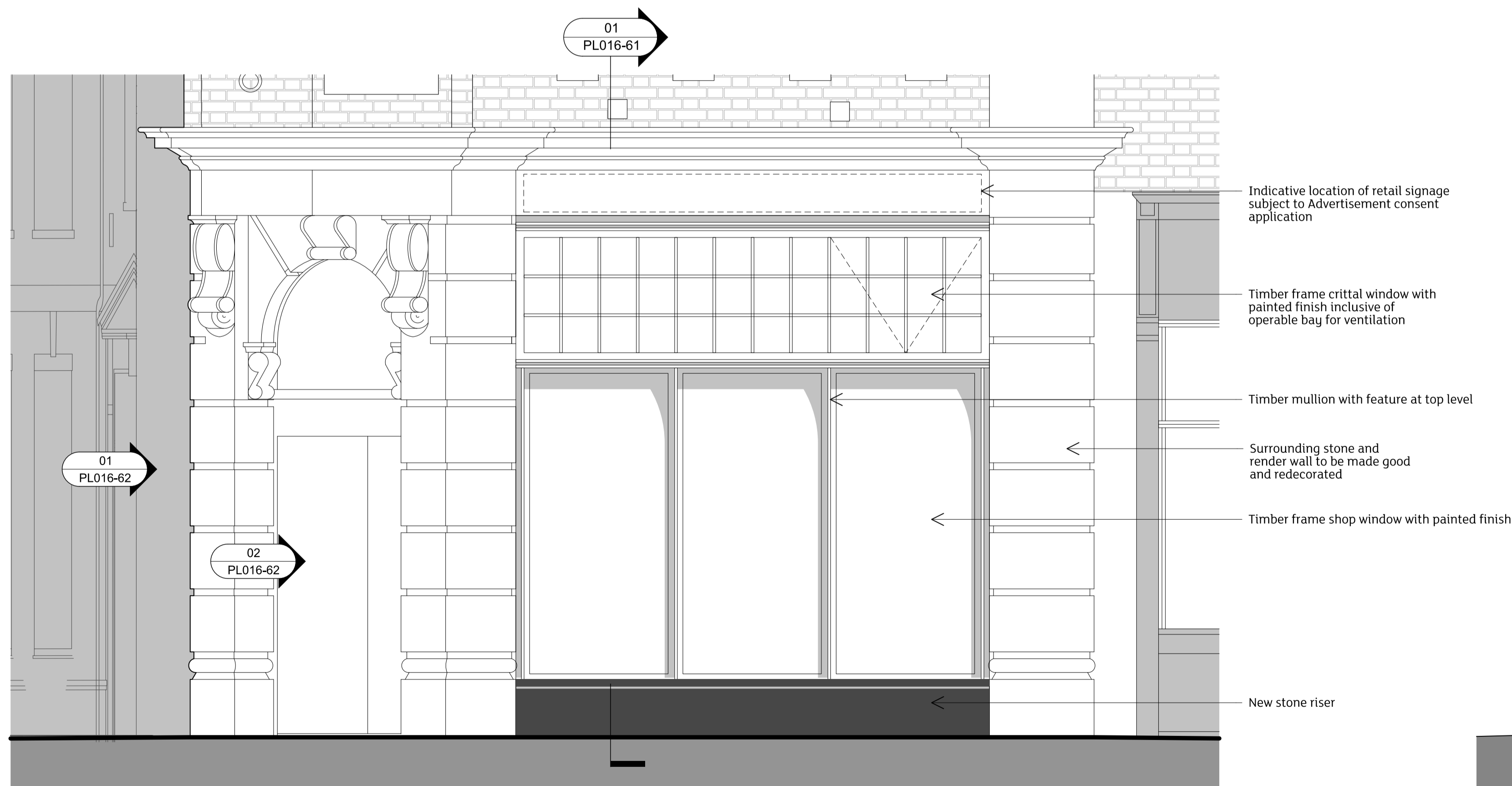
03 28 Denmark Street Proposed East Elevation 1:25