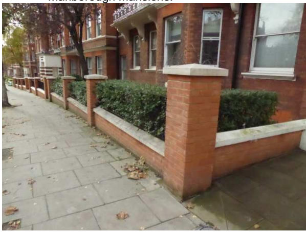
11) View down Cannon Hill showing privet screening to basement flats, behind new railings.