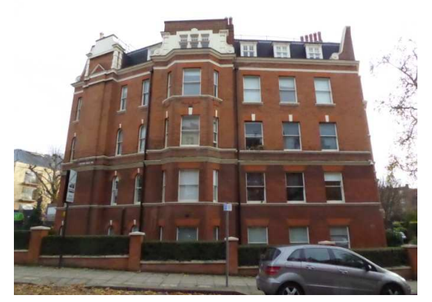
12) New sections of wall outside Avenue Mansions.