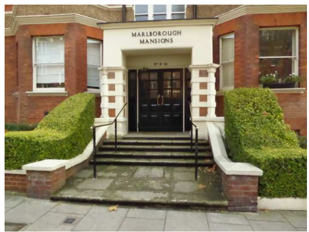
Older section of wall, possibly original, but now modified, outside one of the entrances to Marlborough Mansions.