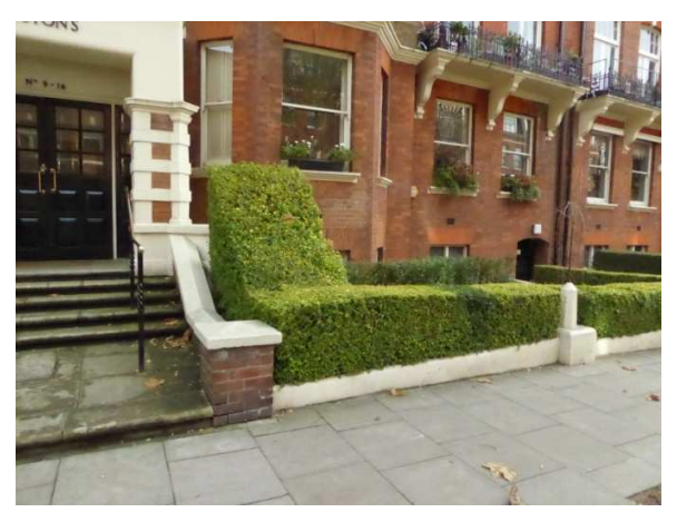
Older section of wall, evidently original, which has been reduced in height and rendered. Pier capped with painted stone obelisk.