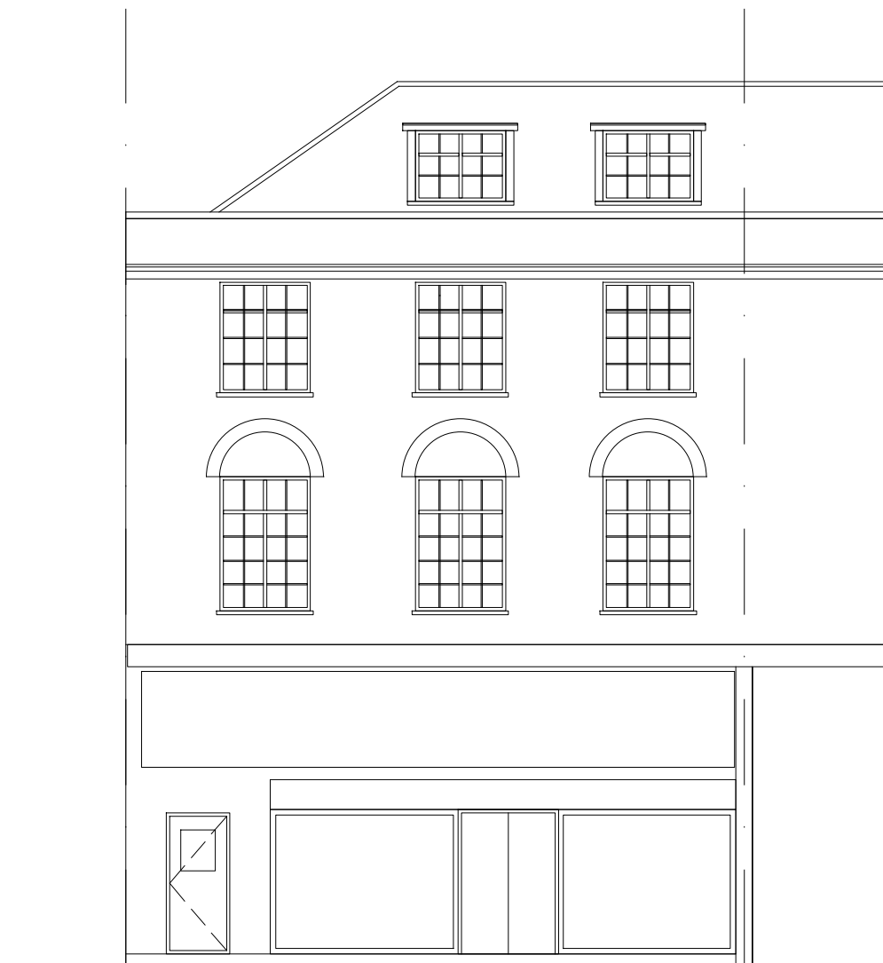
Existing Front Elevation 1:100