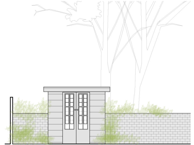
EAST ELEVATION SCALE 1:100