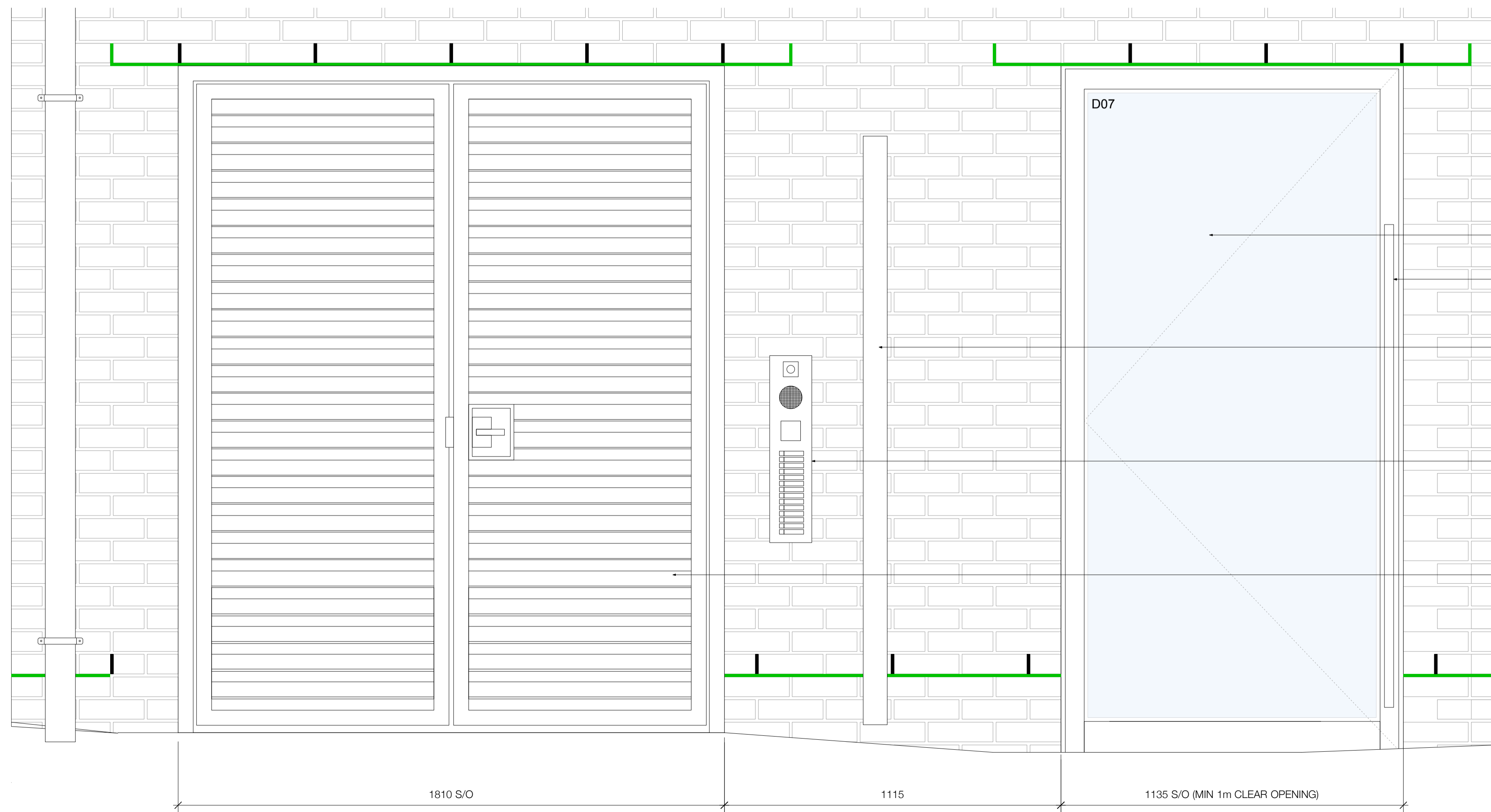
02 EXTERNAL ENTRANCE DOOR - LEVEL ACCESS ELEVATION SCALE, 1:10