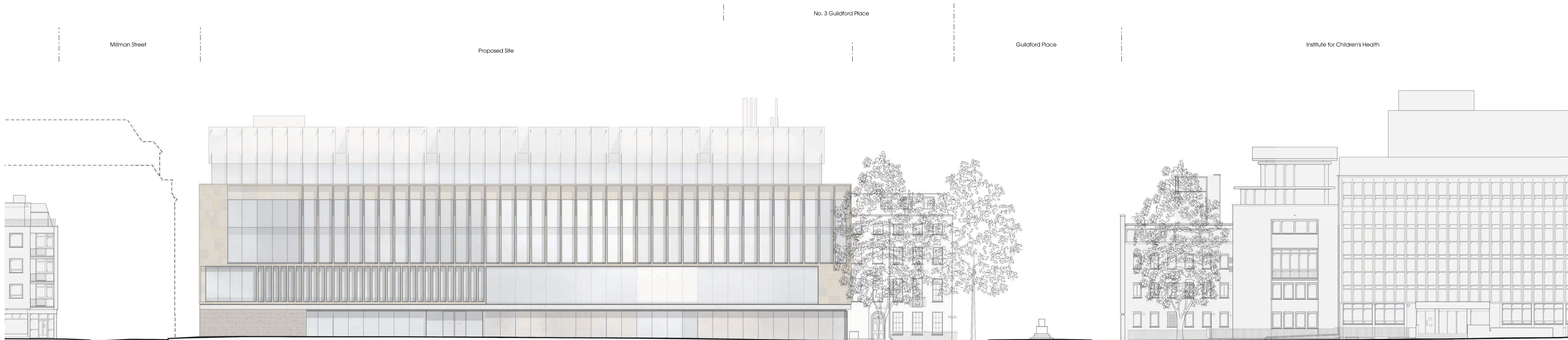
01 | Proposed Context North Elevation PL_215