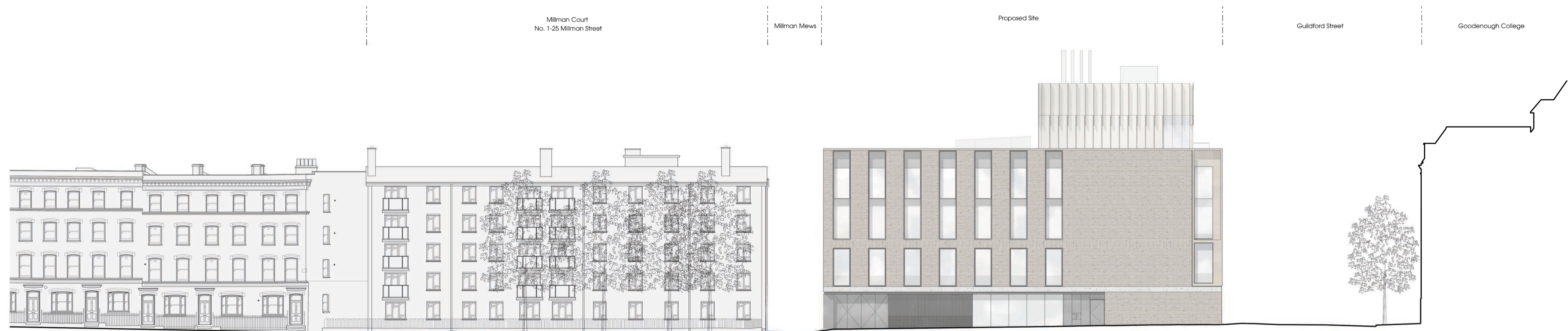
02 | Proposed Context East Elevation PL_215