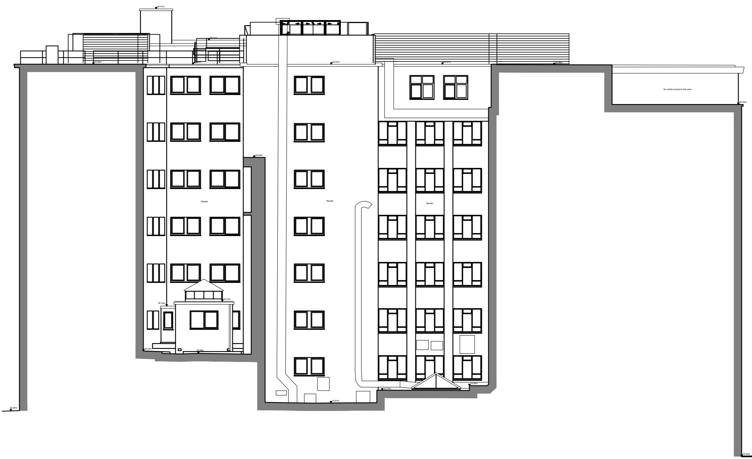
4 REAR ELEVATION 1:150