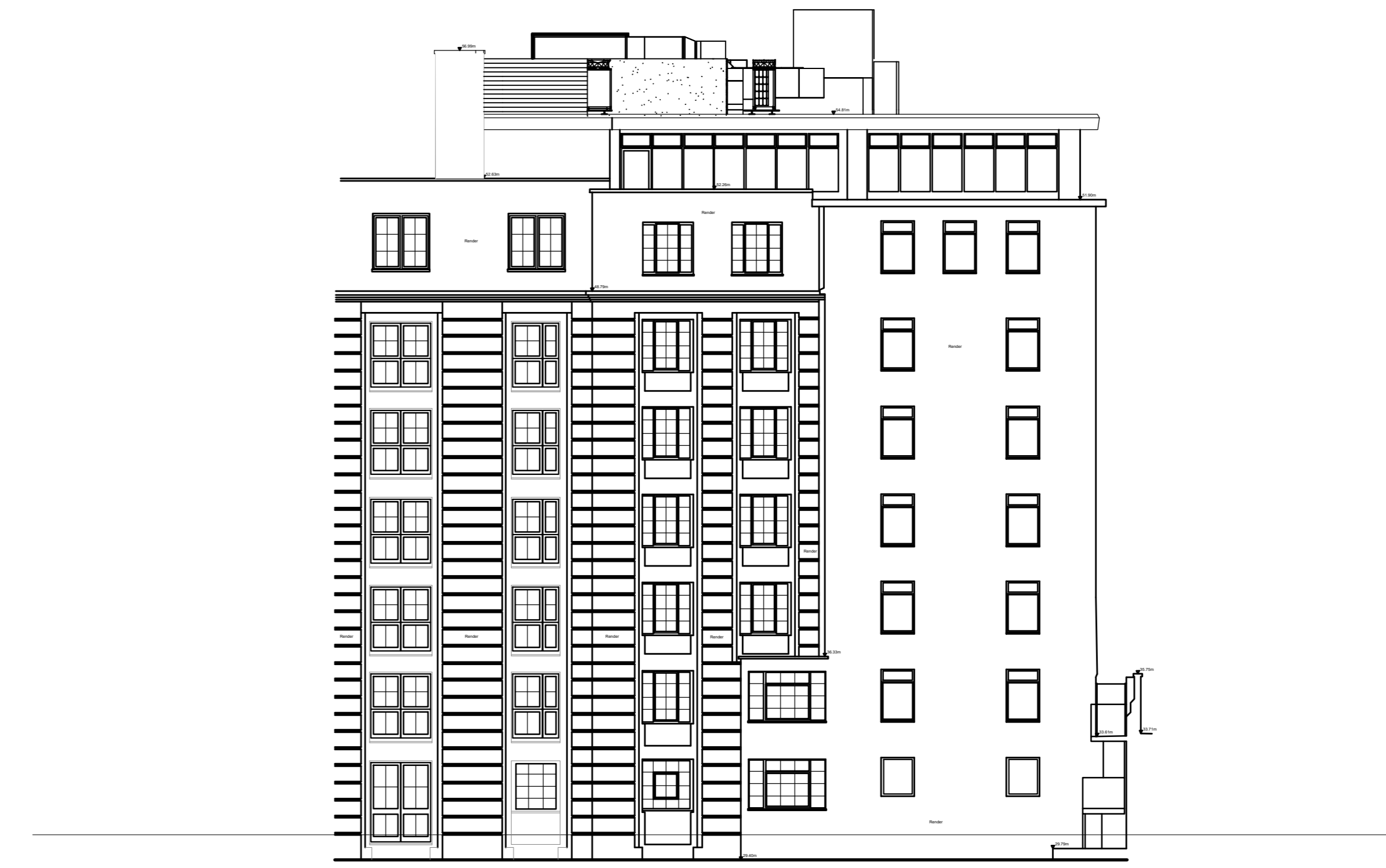
2 CANAL ELEVATION 1:150