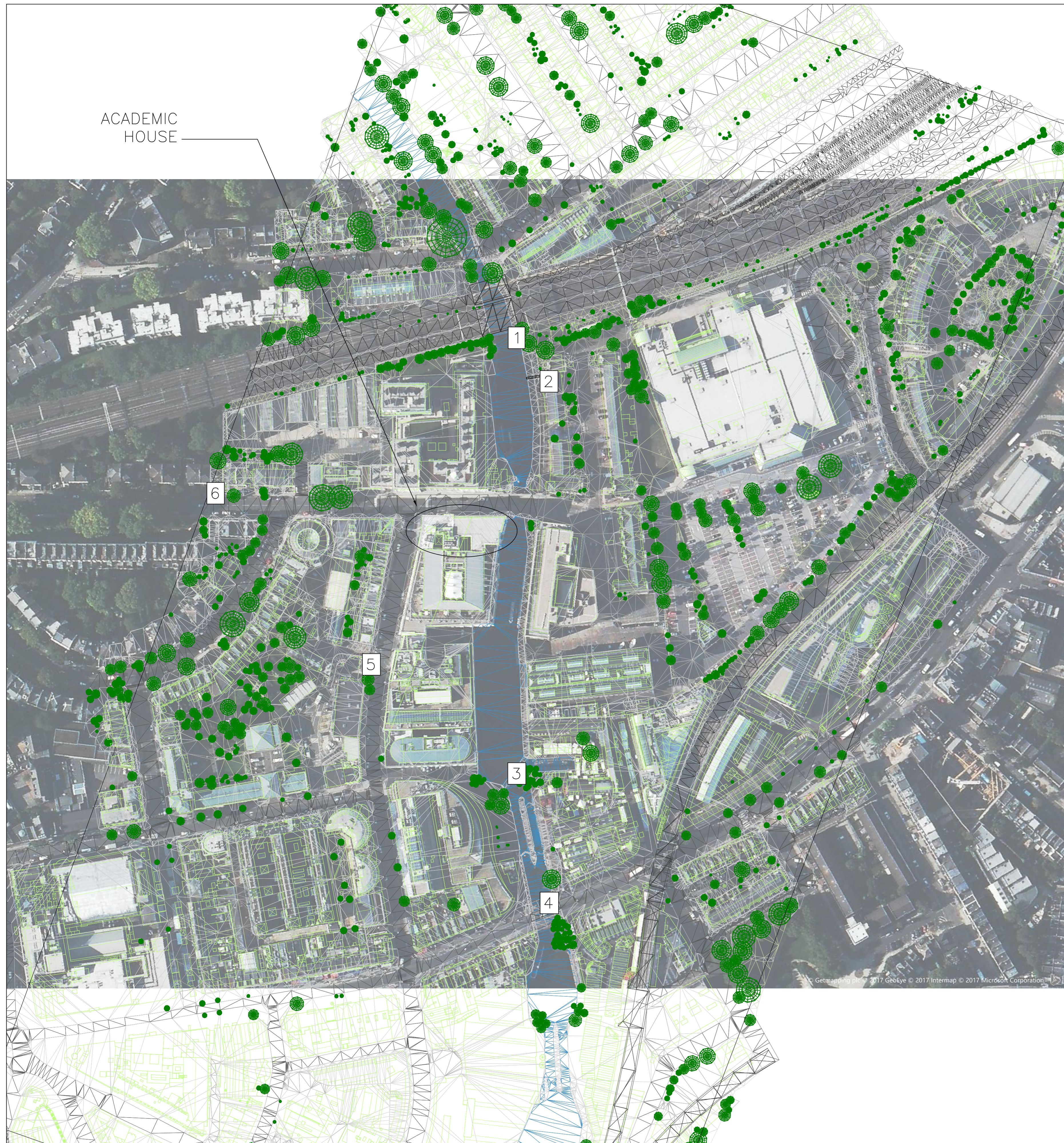
3D MODEL OVERLAY & SIGHT LINES / CAMERA POSITIONS