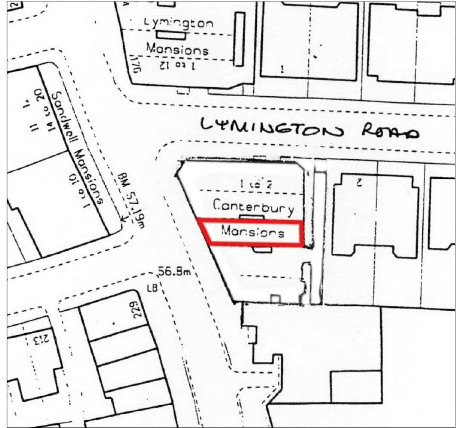
02 LOCATION MAP 1:500