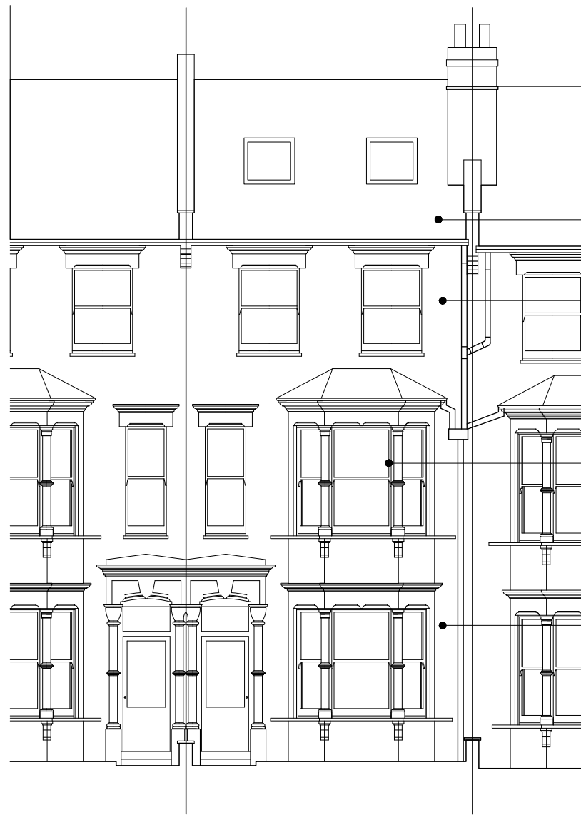
01 ELE PROPOSED SOUTH ELEVATION 1:100